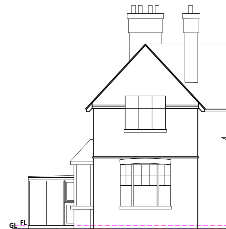
FRONT ELEV. 1:100