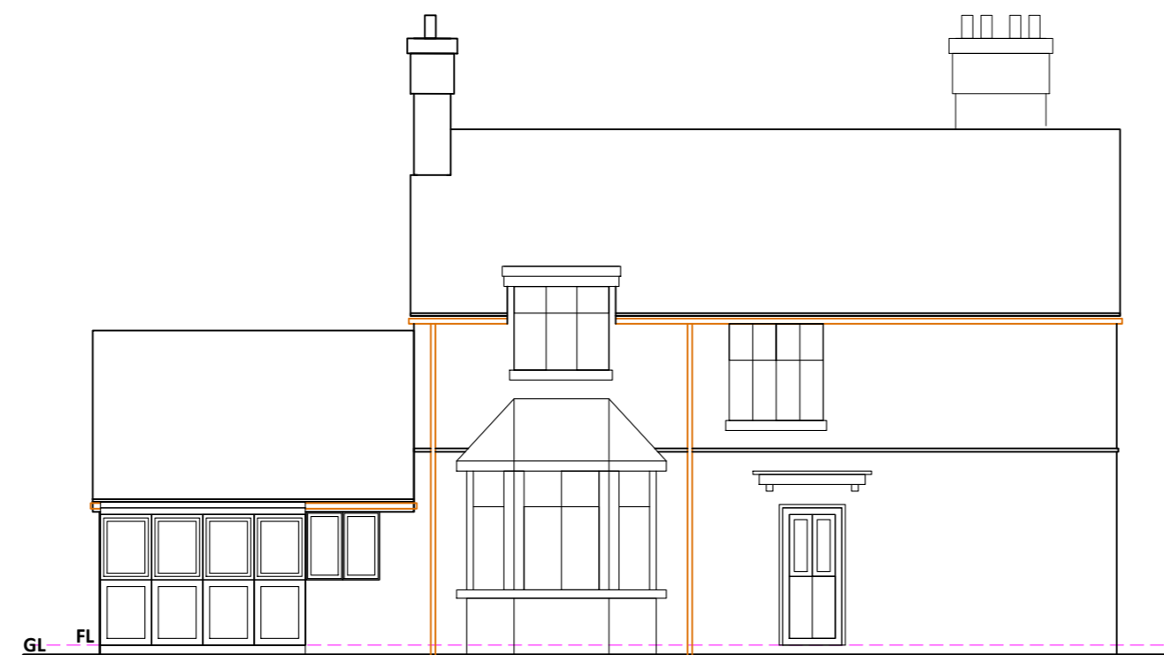
SIDE ELEV. 1:100