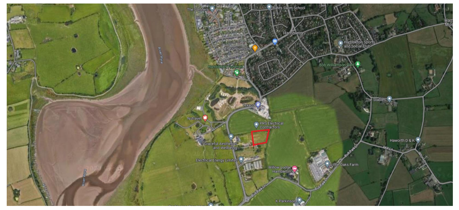
Photograph no01: Aerial View of land adjacent Marsh View, Shard Lane, Hambleton