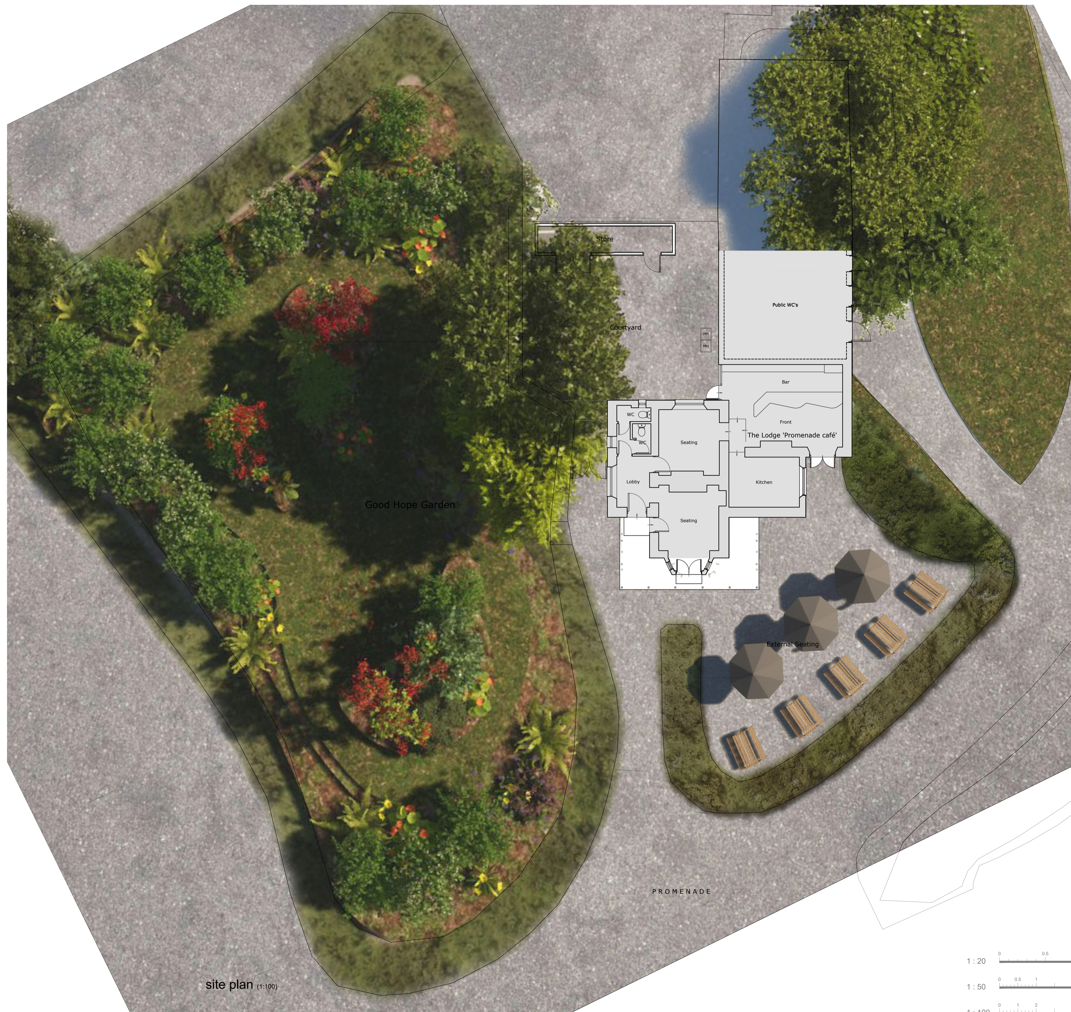
site plan (1:100)