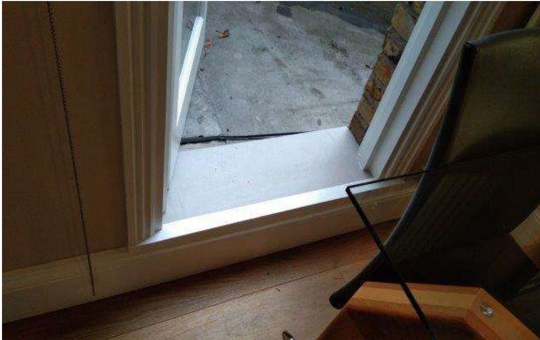
14 View of the grey painted cement render step from inside