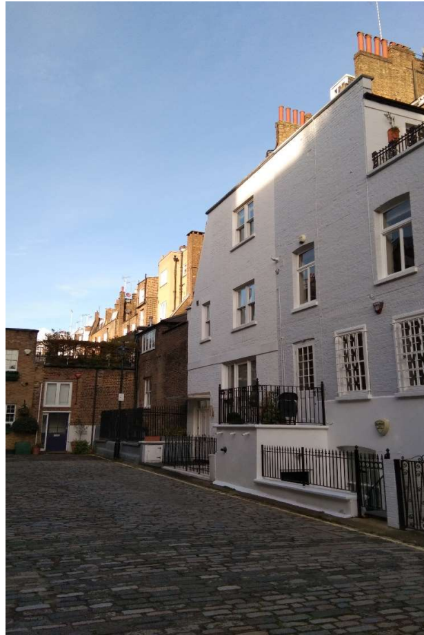
6 Rear view of the property from Montagu Mews ( pic 2)