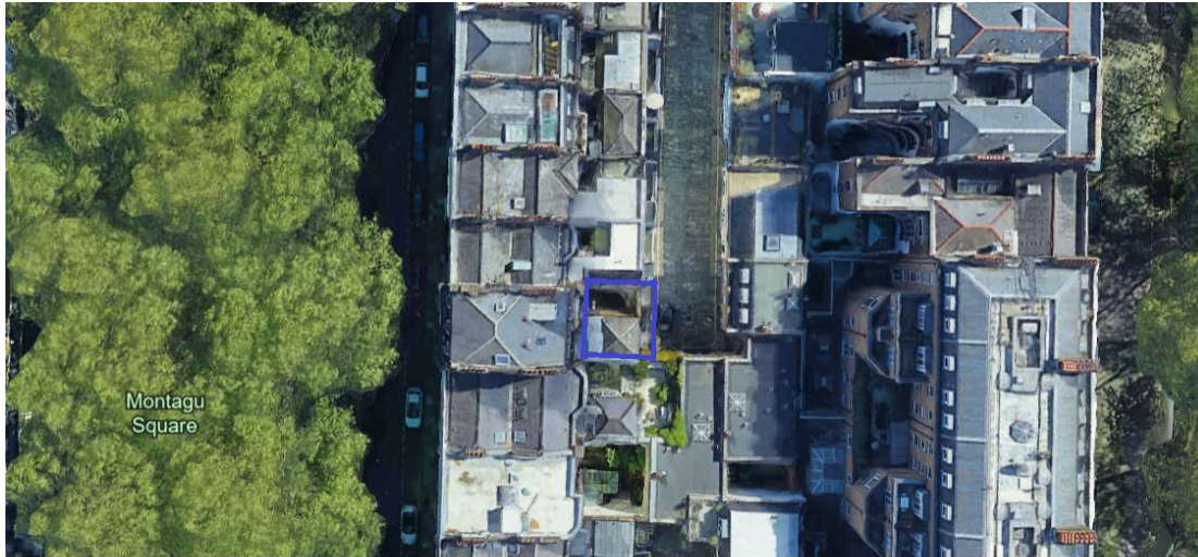
1 Satellite image

Get Planning & Architecture Report Audit