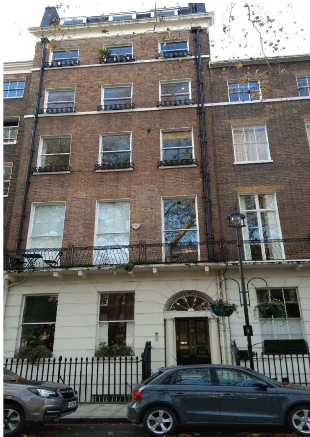
4 Front view of the property