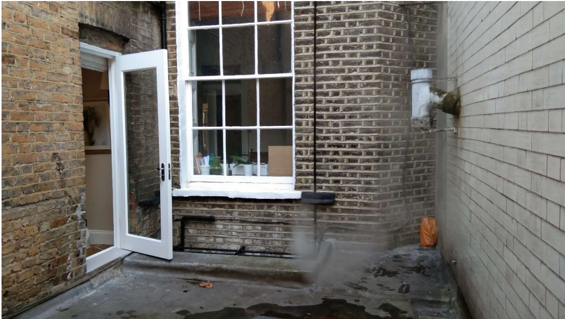
12 view of the door and the yard