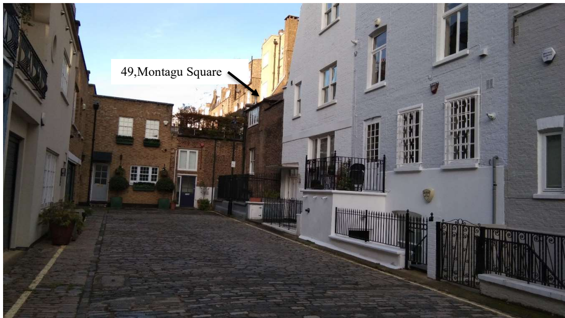
5 Rear view of the property from Montagu Mews