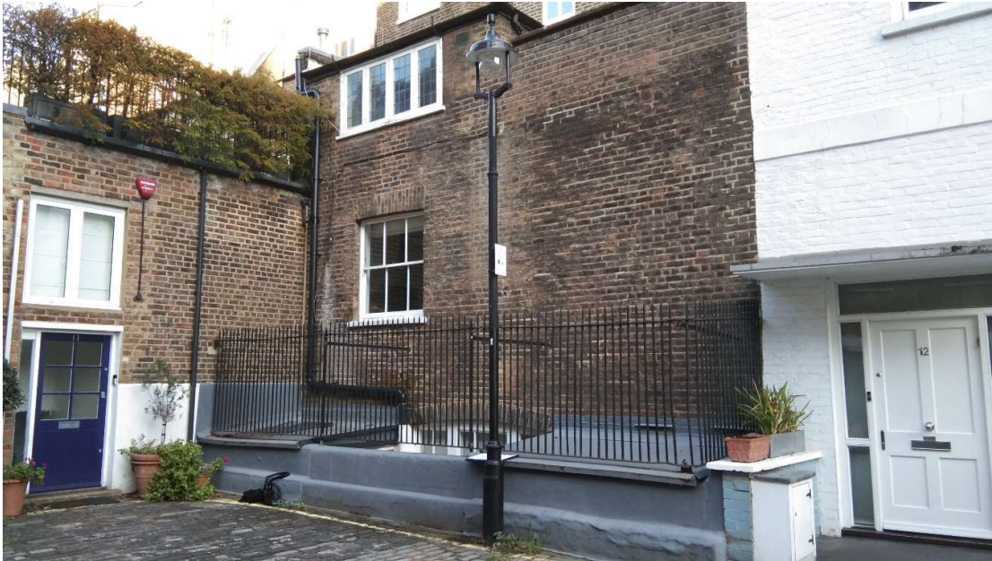
8 Rear view of the property from Montagu Mews ( pic 4)