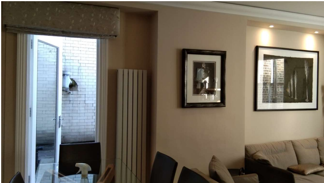
10 view of the door leading to the outer space