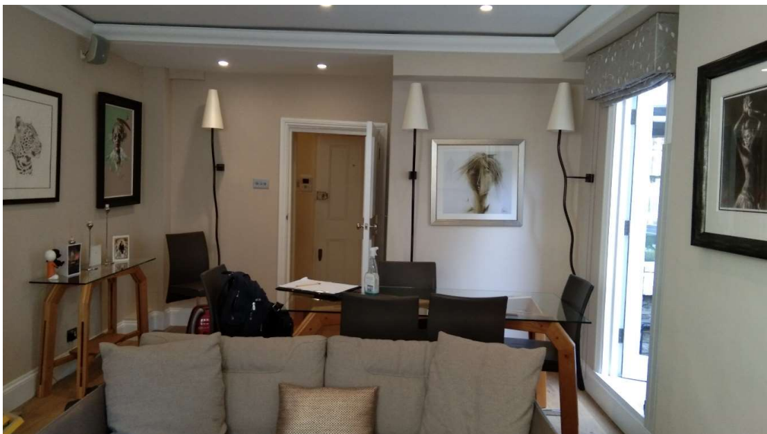
11 view of the Dining