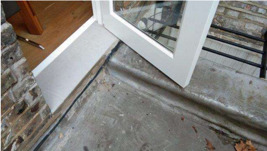
16 View of the grey painted cement render step from outside