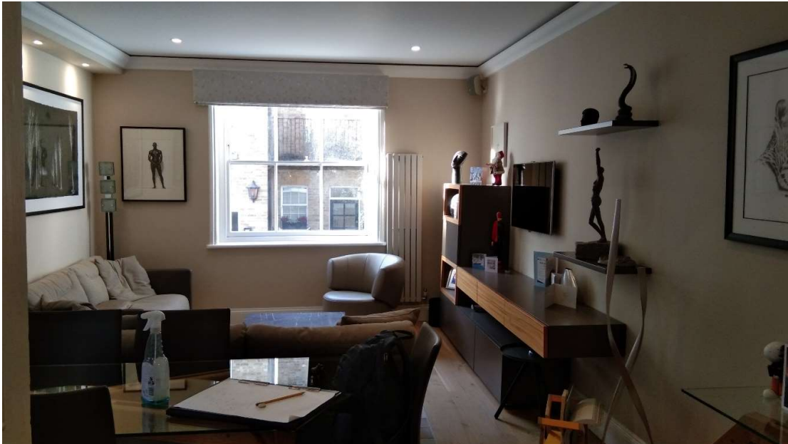
9 view of the Living