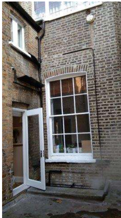
13 view of the door and the yard (pic 2)