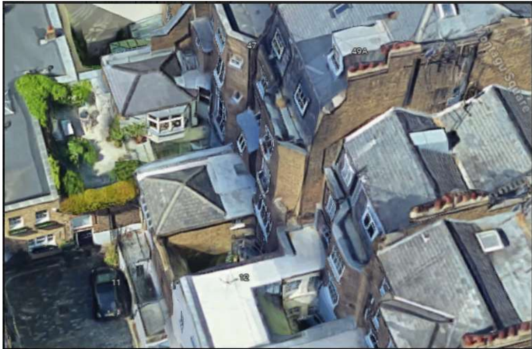
17 3D View of the yard