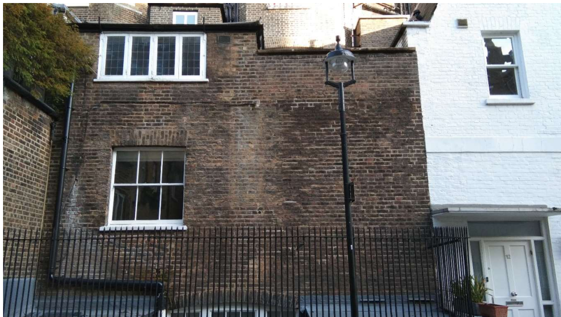
7 Rear view of the property from Montagu Mews ( pic 3)