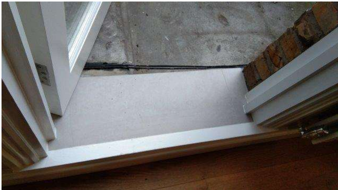
15 View of the grey painted cement render step (pic 2)