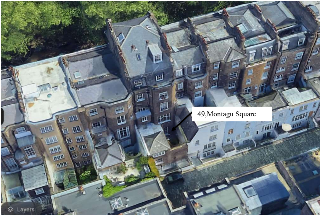
2 2D Rear view of the property from Montagu Mews