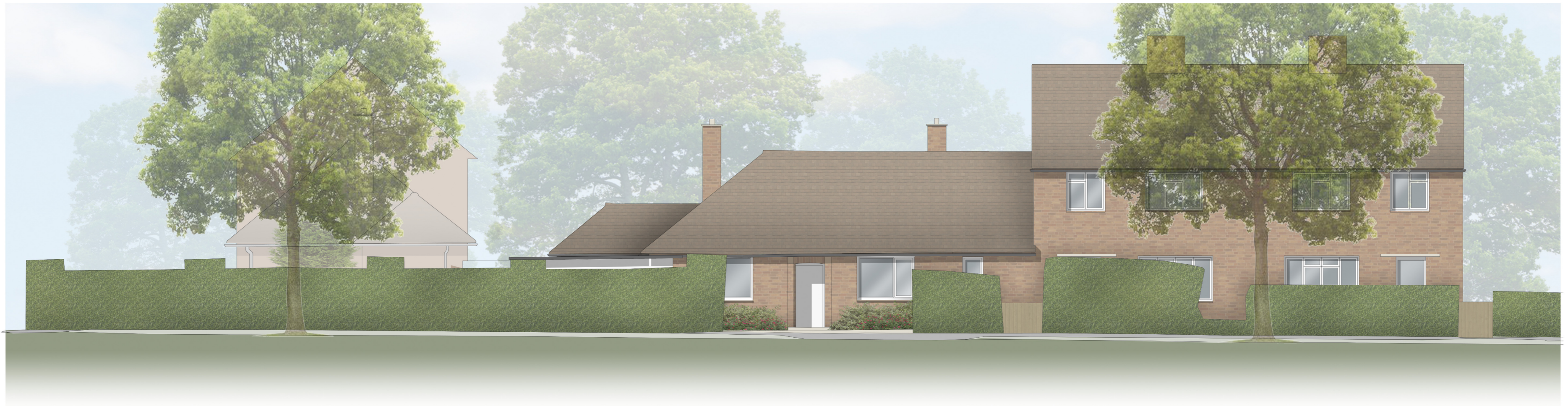
Surly Hall Walk Street Scene