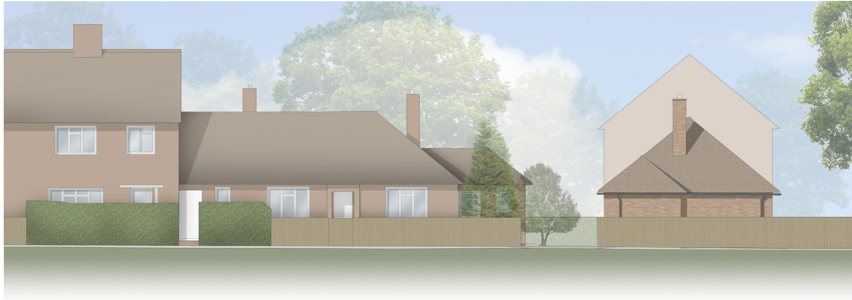
Dedworth Drive Street Scene