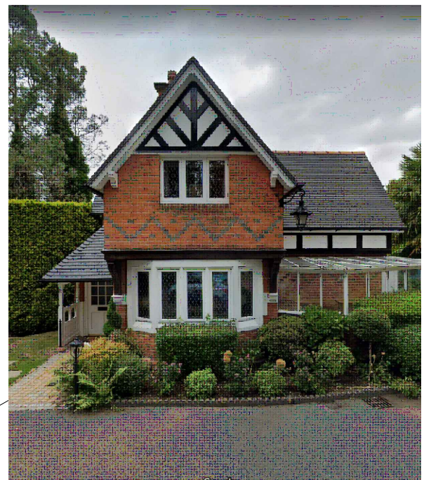
The two above photo show the principal elevation of Whitebrook house, fronting Islet Park

Do not Scale. Use figured dimensions only. Subject to site survey and all necessary consents. All dimensions to be checked by user and any discrepancies, errors or omissions to be reported to the Architect before work commences. This drawing is to be read in conjunction with all other relevant materials.