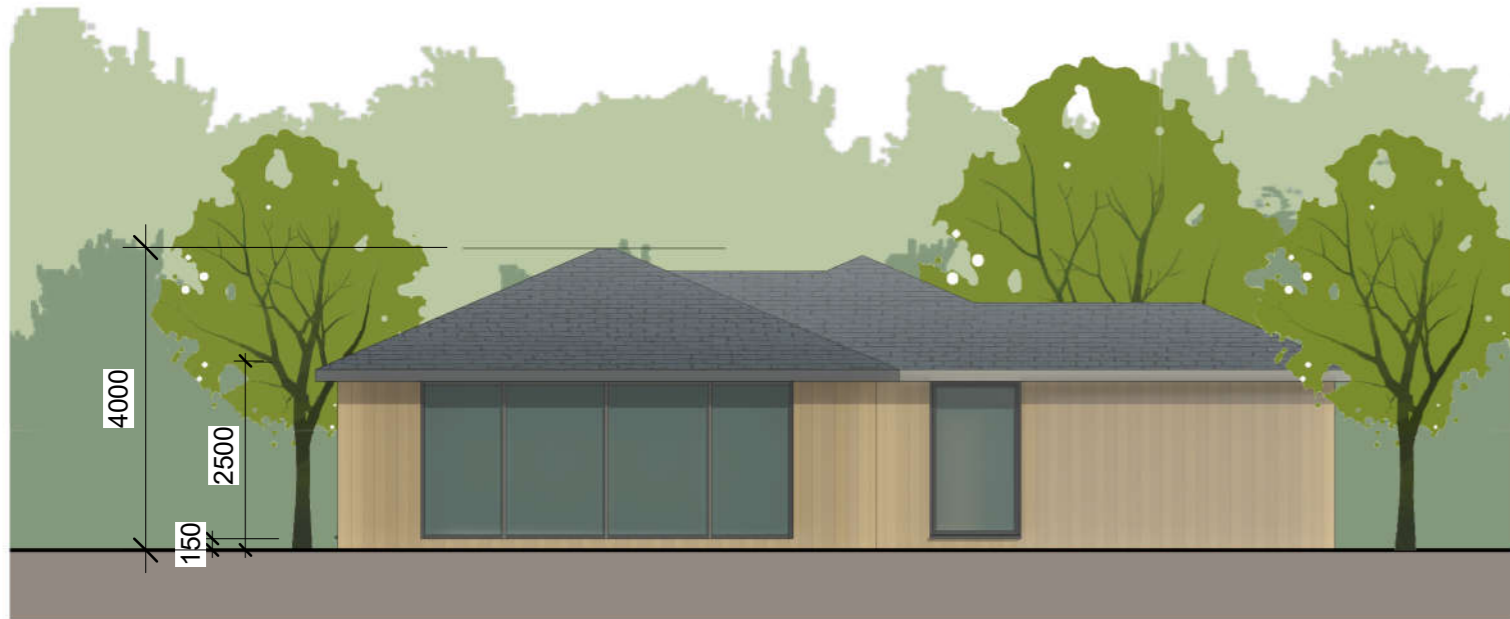
Proposed Front Elevation (South-West)