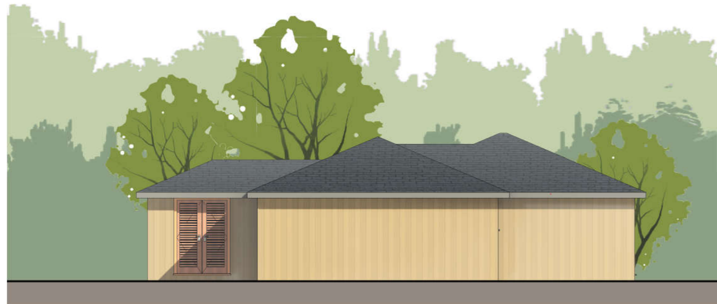
Proposed Rear Elevation (North-East)