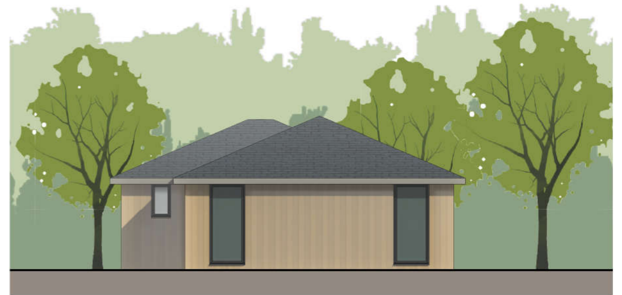
Proposed Side Elevation (North-West)