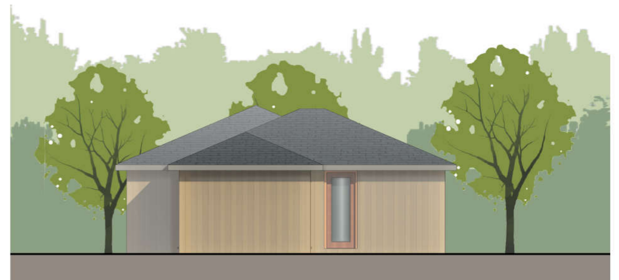
Proposed Side Elevation (South-East)

Do not Scale. Use figured dimensions only. Subject to site survey and all necessary consents. All dimensions to be checked by user and any discrepancies, errors or omissions to be reported to the Architect before work commences. This drawing is to be read in conjunction with all other relevant materials.