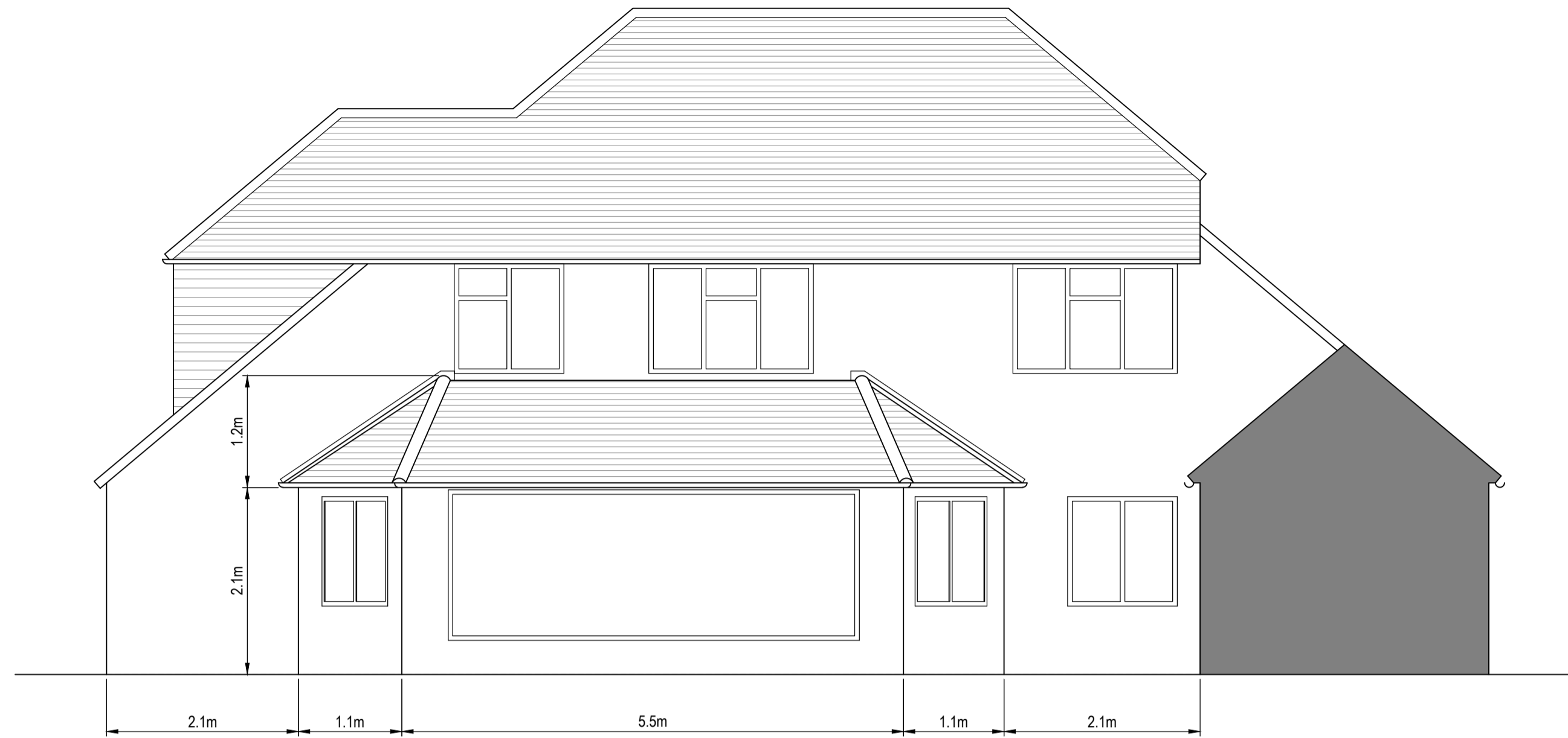
EXISTING WEST ELEVATION SCALE 1:50