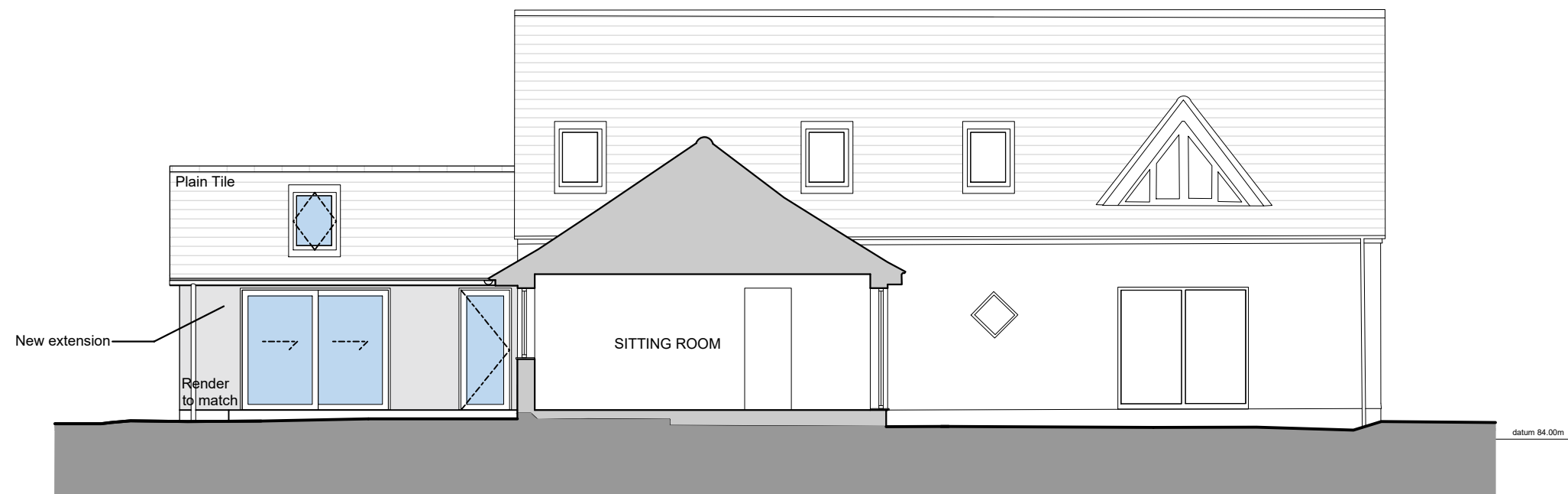
Section AA 1:100