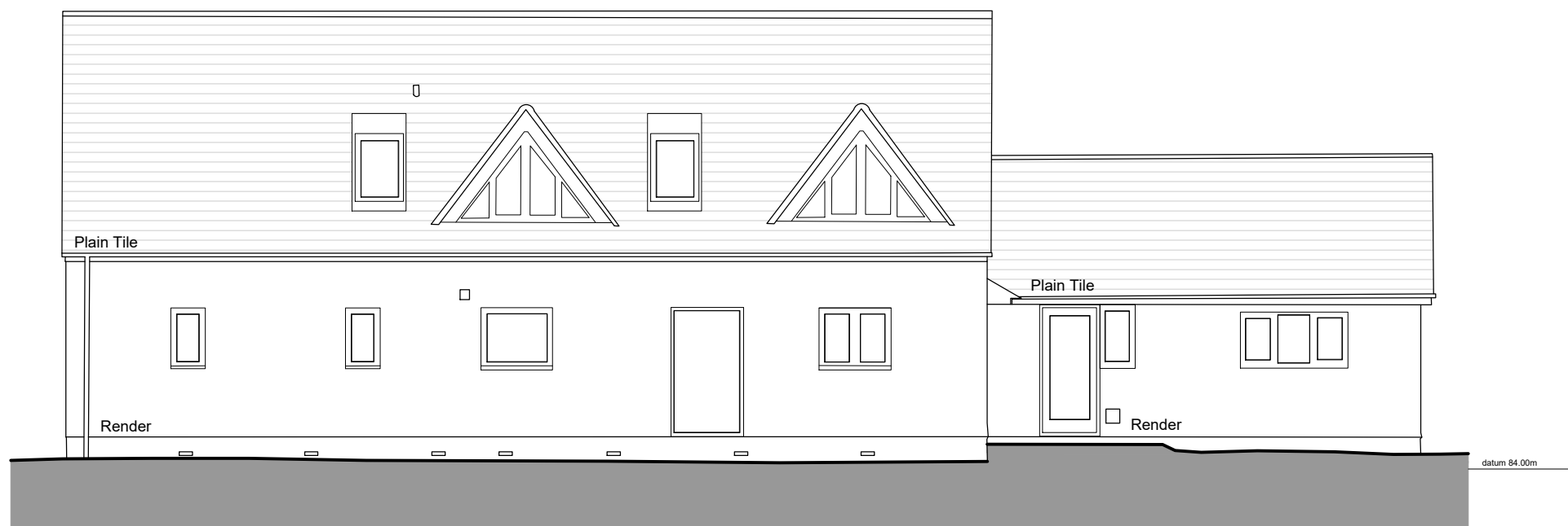
East Elevation 1:100