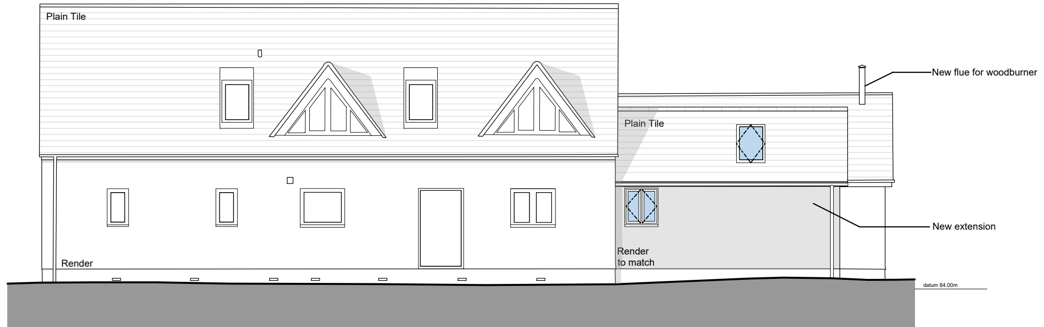
East Elevation 1:100