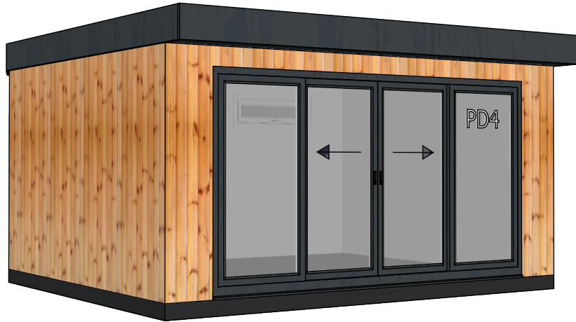
Visual 1 | Not to scale