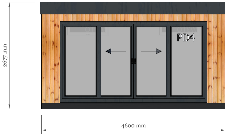
High Side Elevation - 03 | 1:50 @ A4