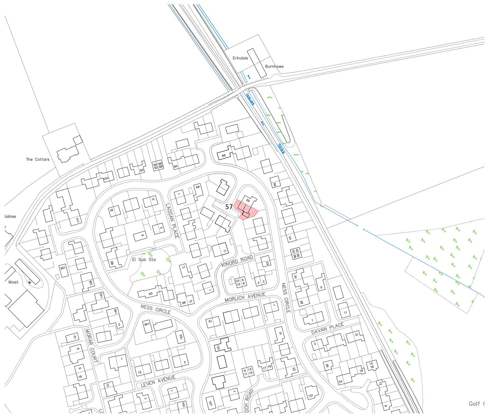
Location Plan Scale 1:2500 GRID REFERENCE: NJ 94671 31611