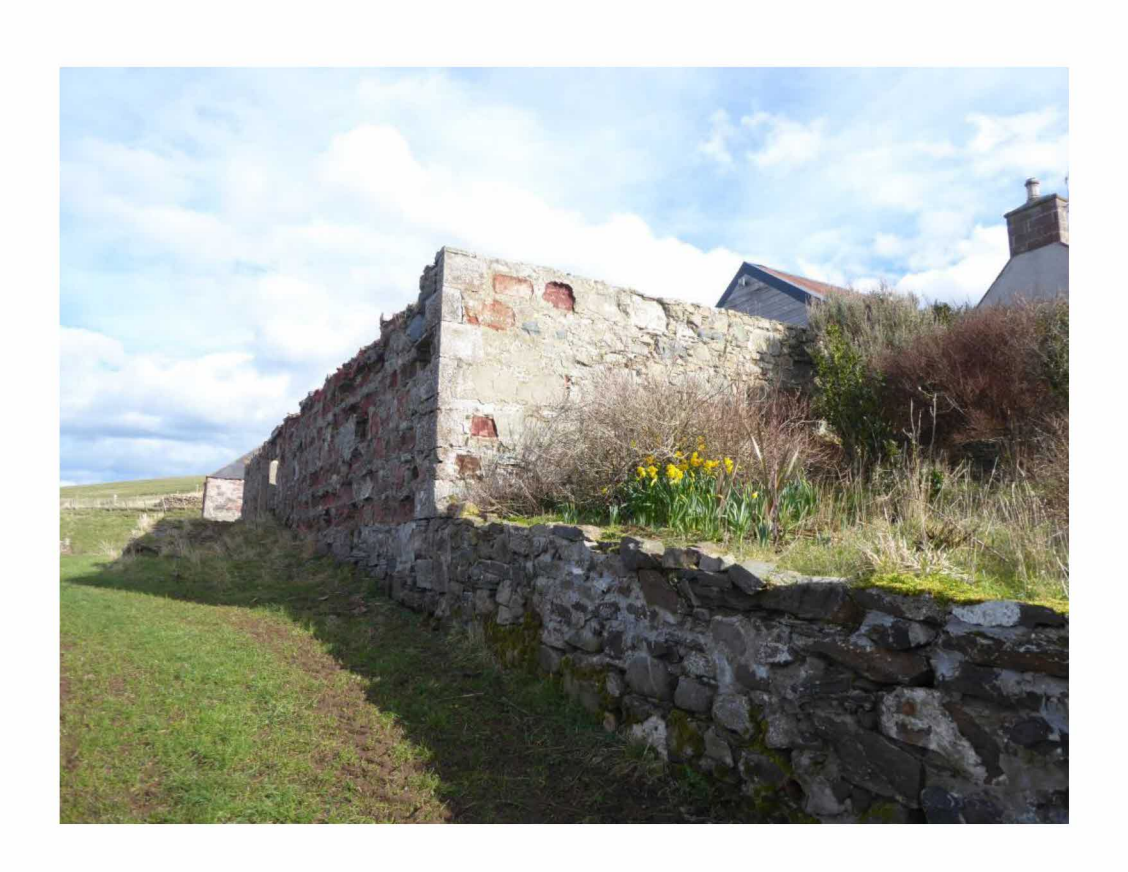
7) Looking East