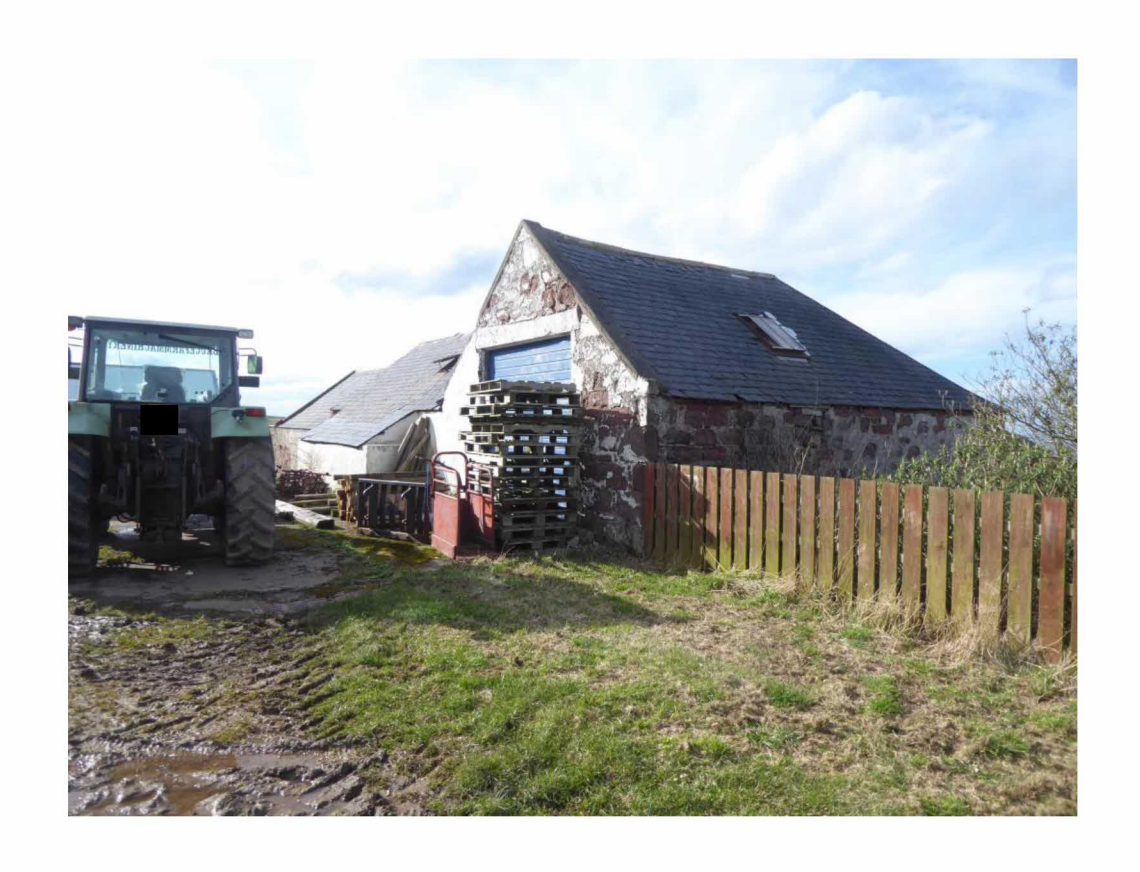
4) Looking West