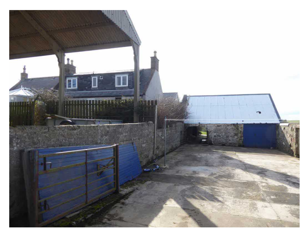
1) Looking West