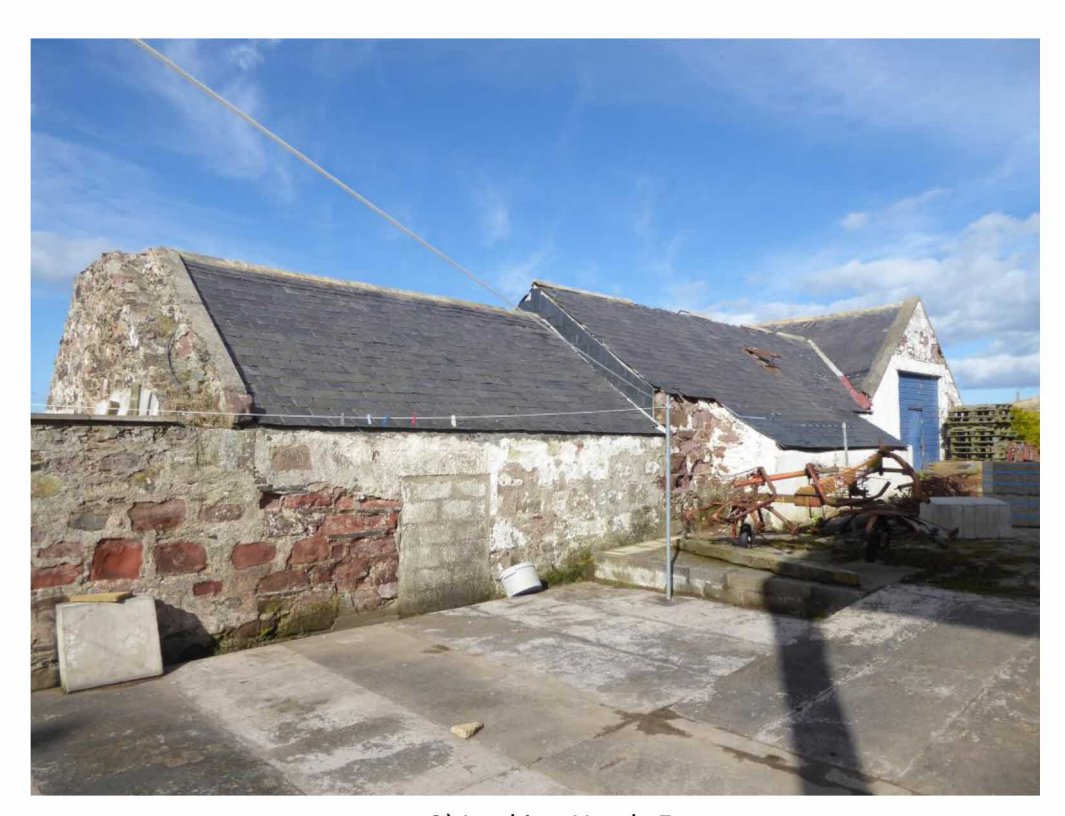
3) Looking North-East