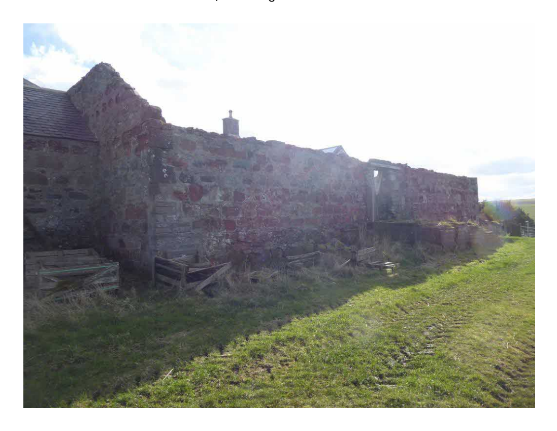
6) Looking South-East