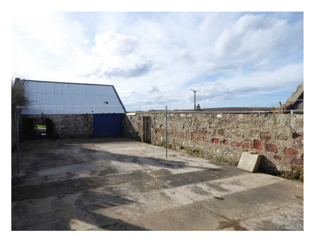
2) Looking West