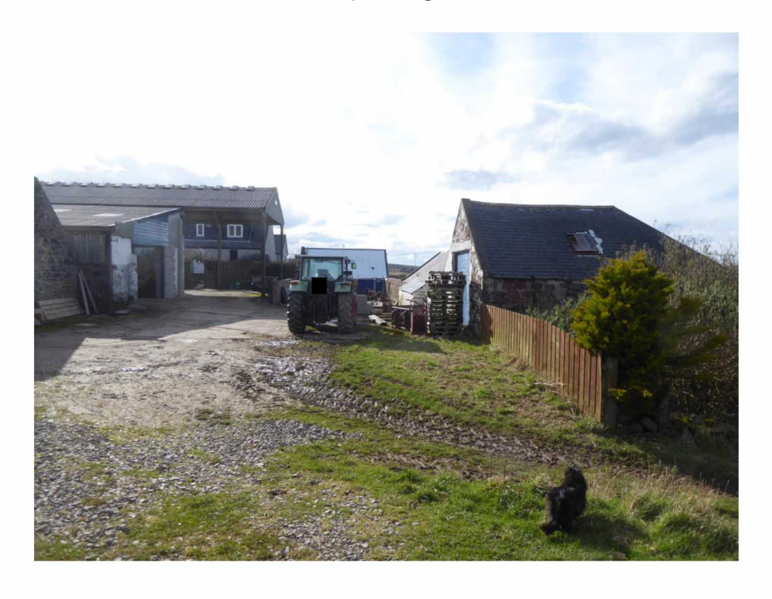
8) Looking West