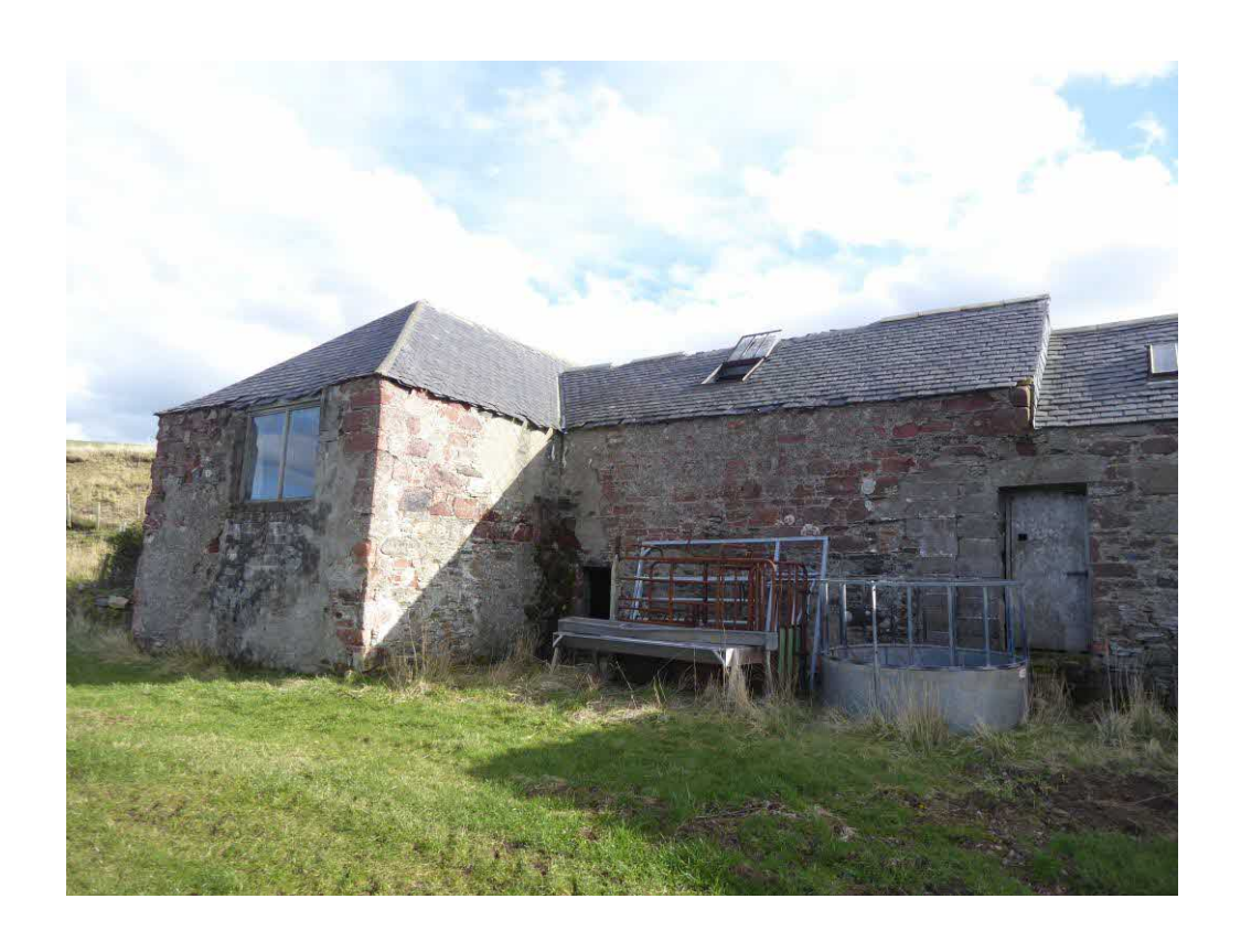
5) Looking South-East