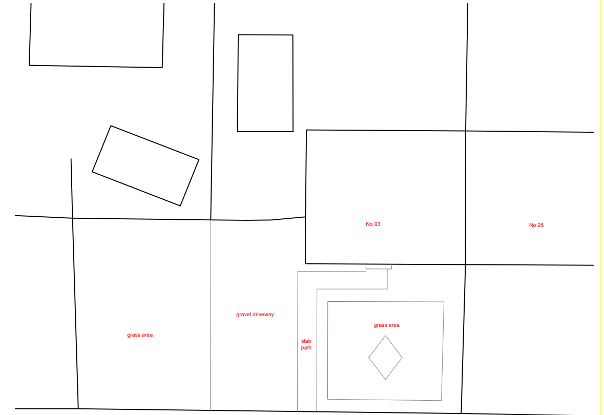
PARTIAL SITE PLAN - AS EXISTING scale 1:200 @A3