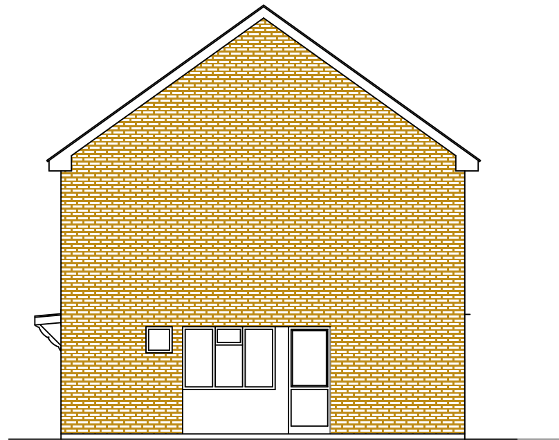
EXISTING SIDE ELEVATION -A