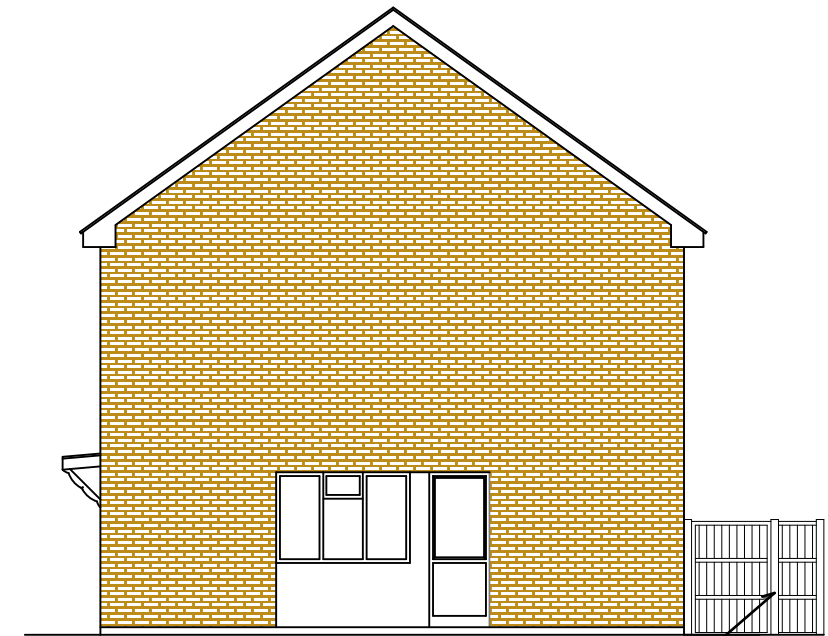
Proposed 1.5m High Timber Fence For Privacy