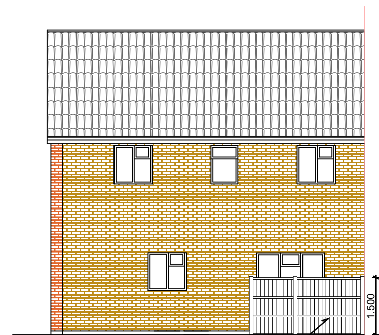
Proposed 1.5m High Timber Fence For Privacy