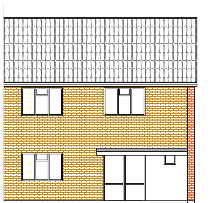
PRE-EXISTING FRONT ELEVATION