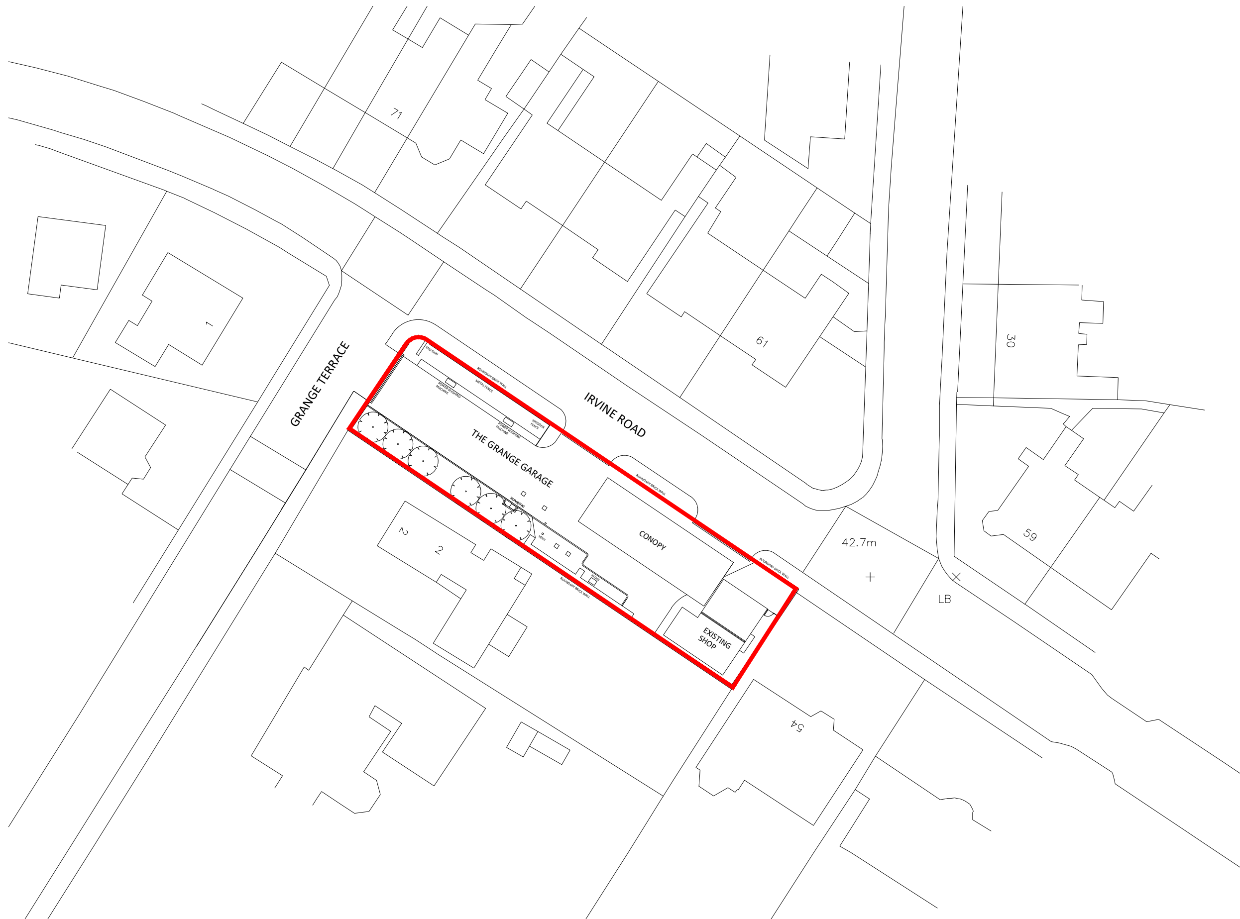
EXISTING LOCATION PLAN 1:500