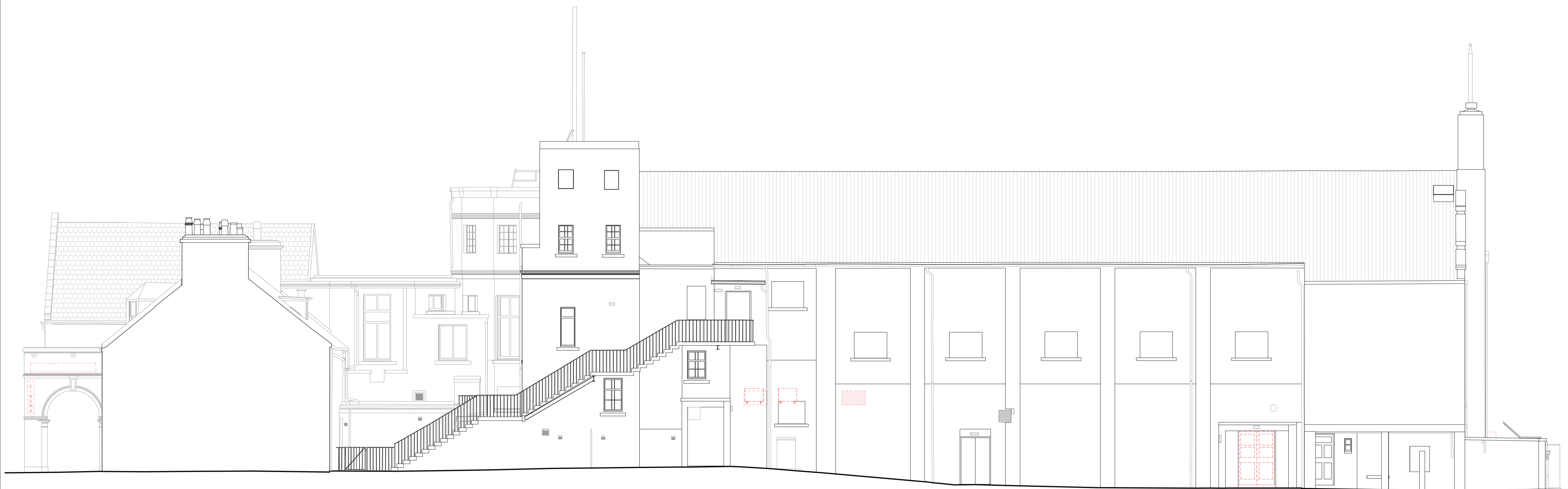
Downtakings Elevation 2