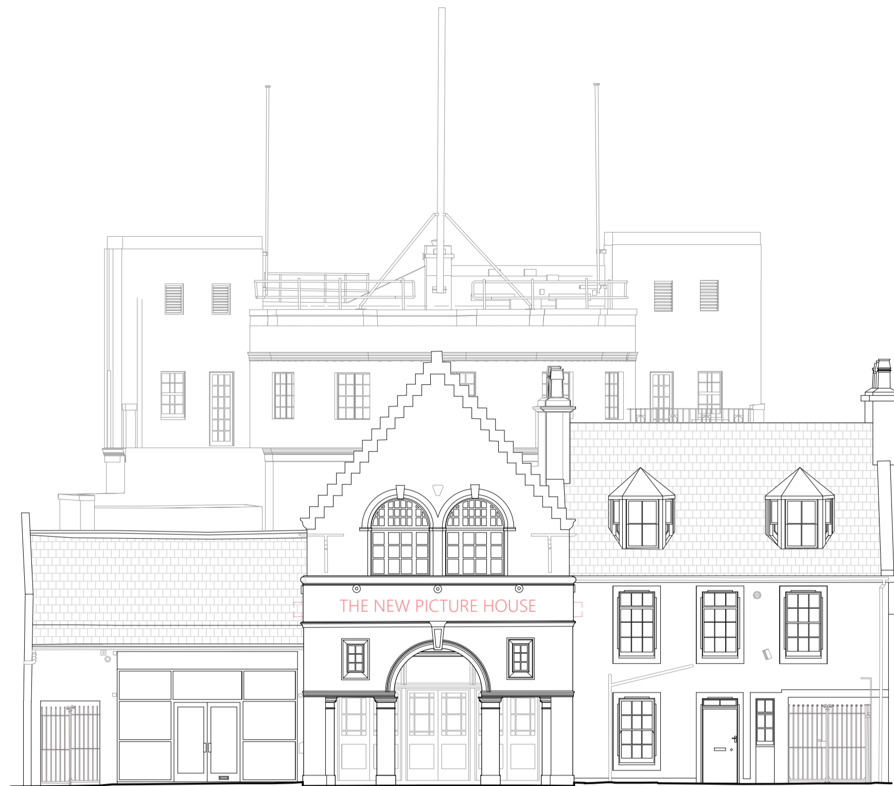
Downtakings Elevation 1