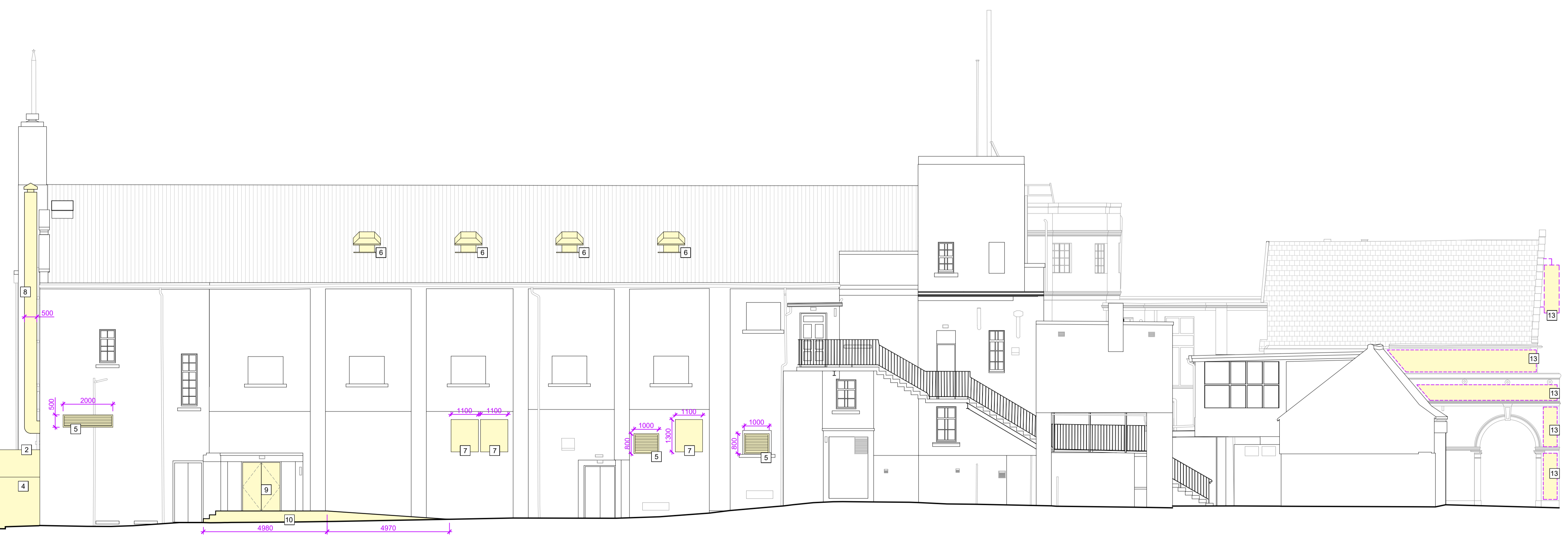
Proposed Elevation 4