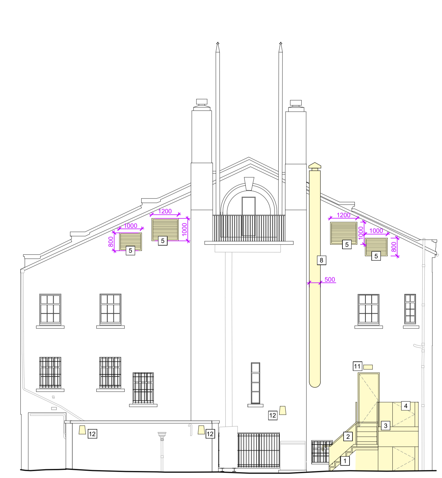
Proposed Elevation 3

Notes Do not scale from this drawing for purposes other than those associated with the planning application process. All dimensions are to be checked prior to construction and any discrepancies are to be identified to the Architect. Copyright reserved. All works are subject to statutory approval and as such the layout shown is subject to change following consultation with the necessary authorities. The drawings have been prepared for our client, TS SA Property Holdings, are approximate only and have been based upon survey model & drawings provided by Malcolm Hughes Land Surveyors Limited March 2024. Following strip-out & down-takings, further surveys are to be undertaken upon retained elements to establish existing build-ups and site dimensions/ depth. Note that proposals may vary to suit existing site circumstances.