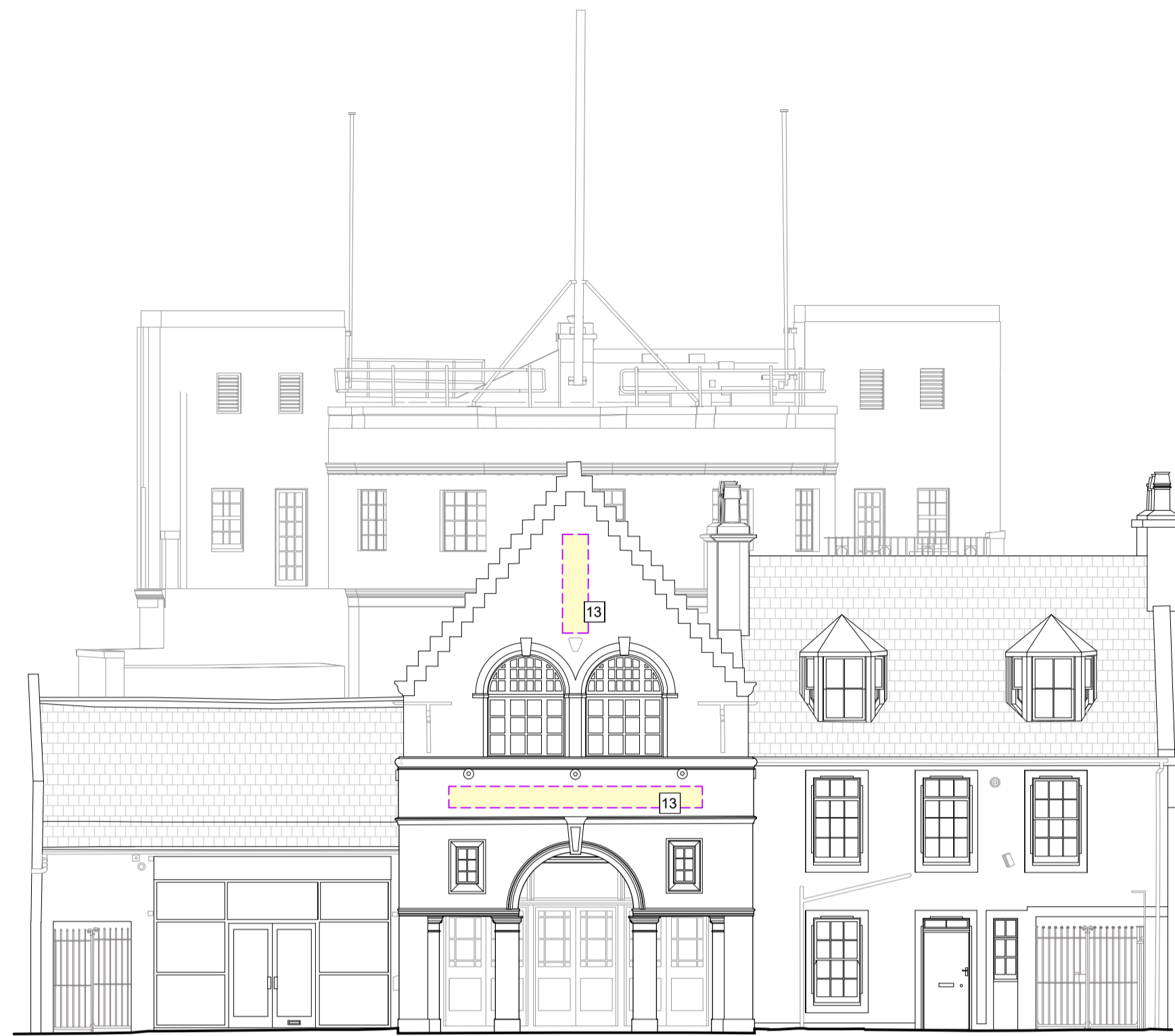
Proposed Elevation 1