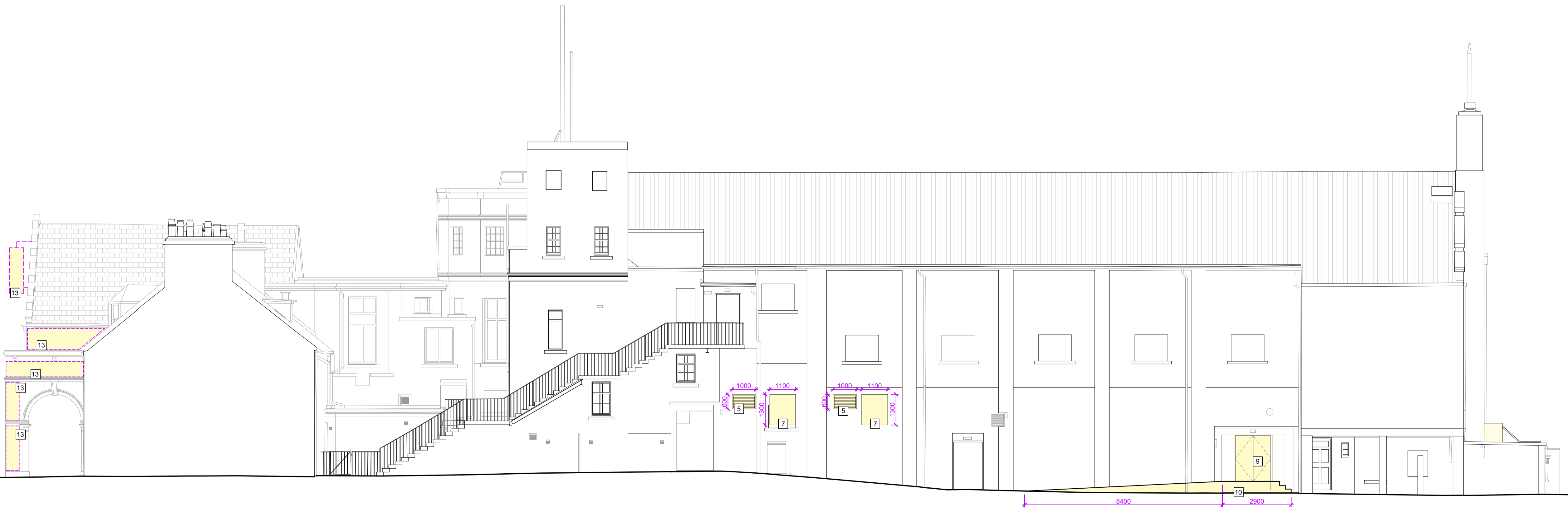
Proposed Elevation 2