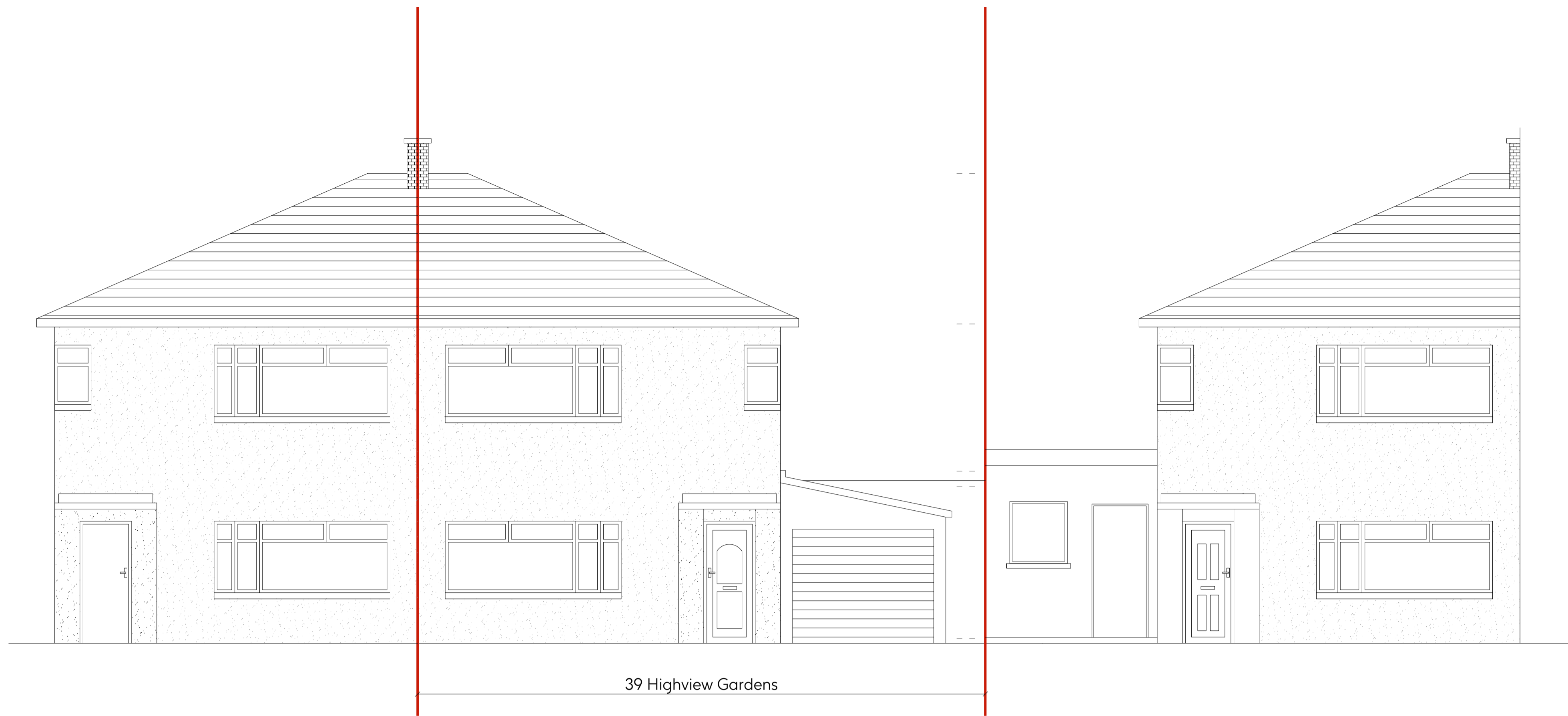
1 Existing Front Elevation