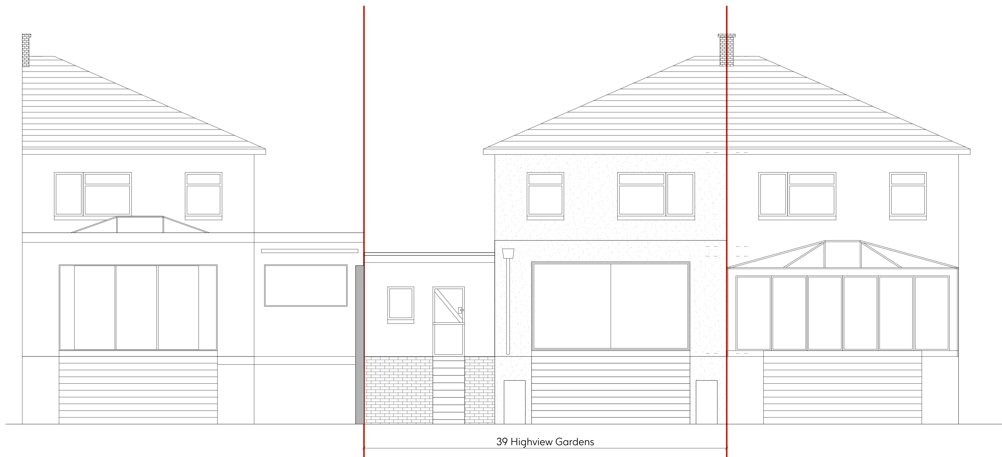
2 Existing Rear Elevation