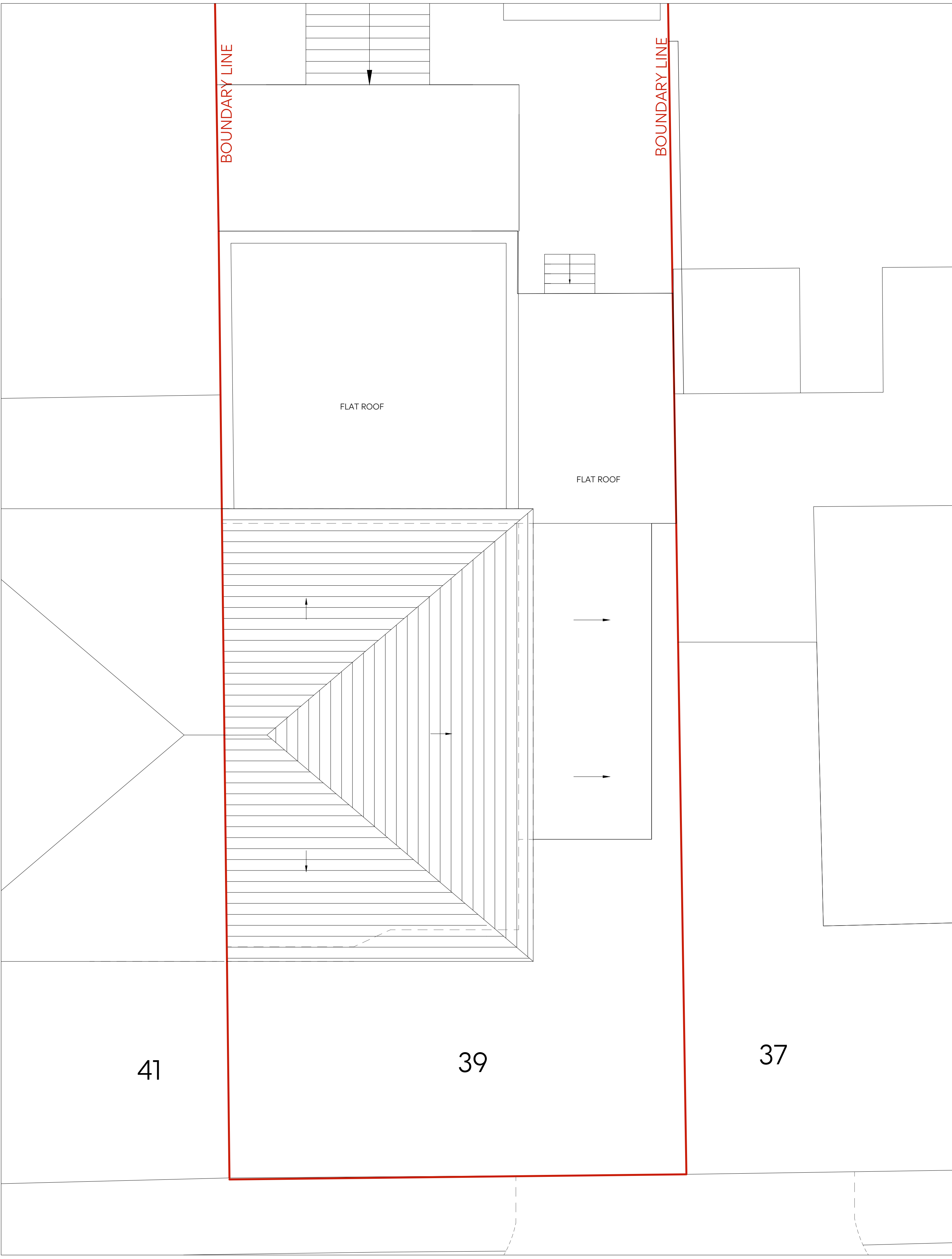
1 Existing Roof Plan