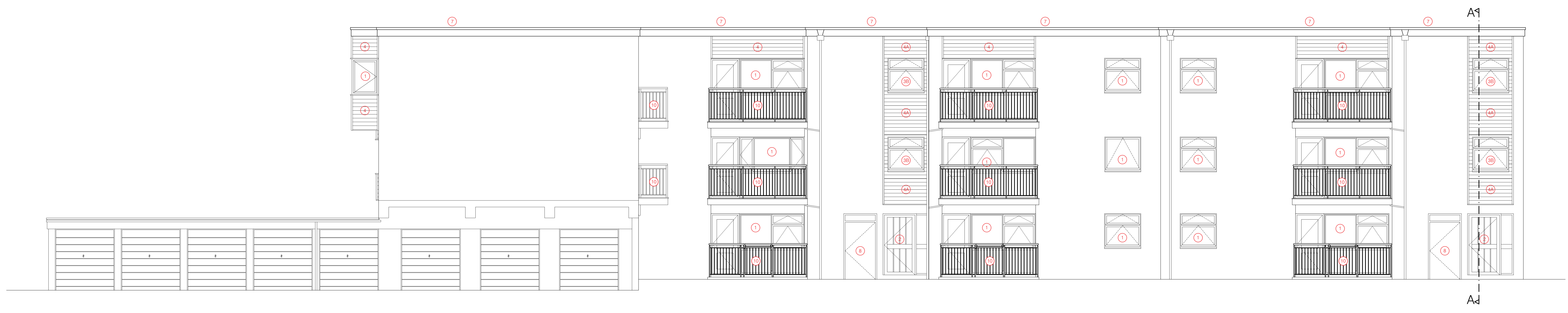
Proposed Elevation C