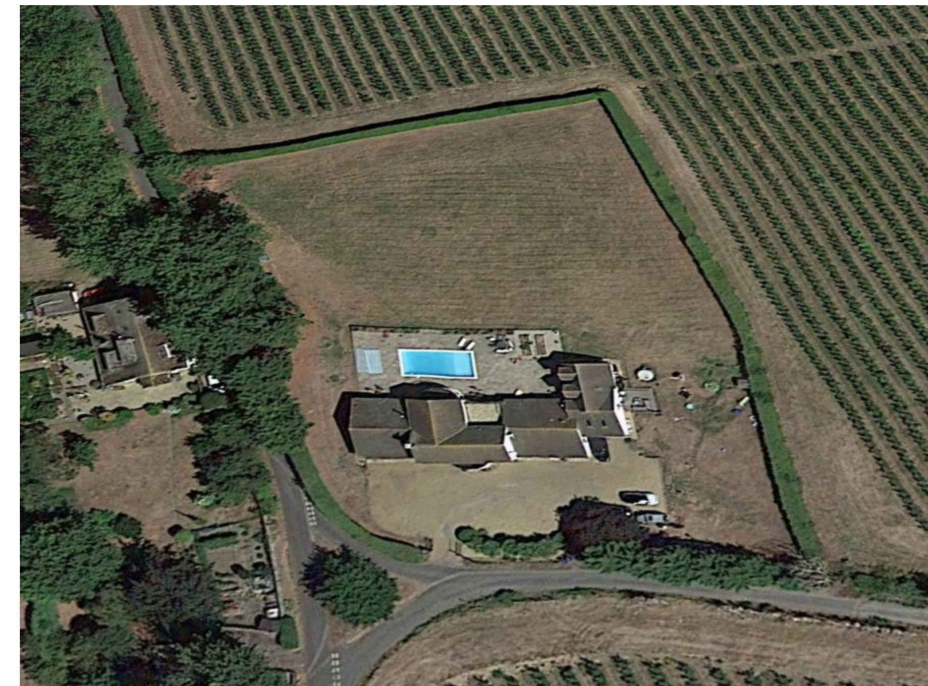
3 Google Earth - Twinney Acre 1:1