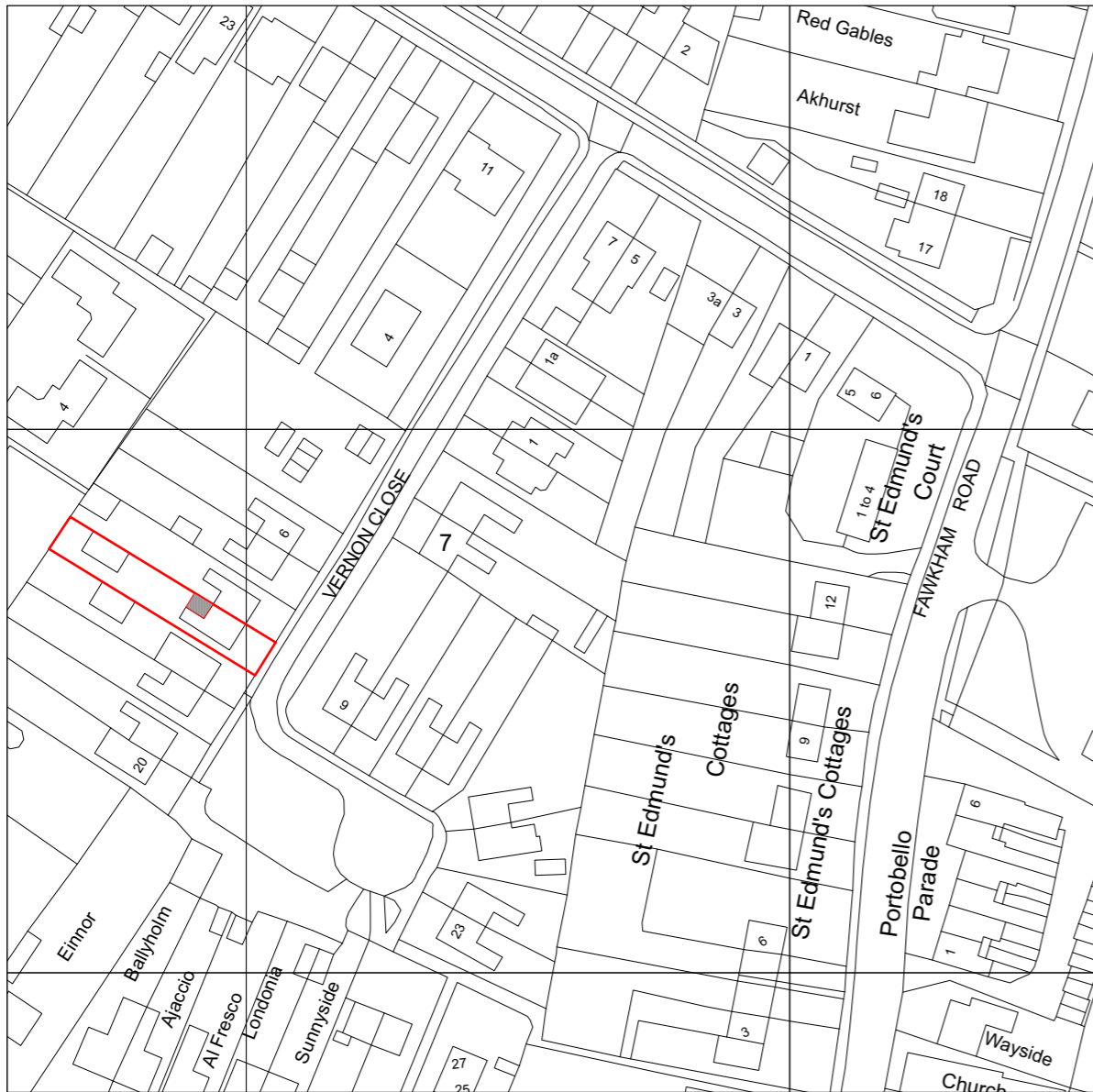
LOCATION PLAN Scale: 1:1250 @ A3