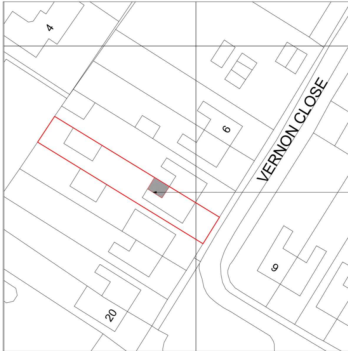
BLOCK PLAN Scale: 1:500 @ A3