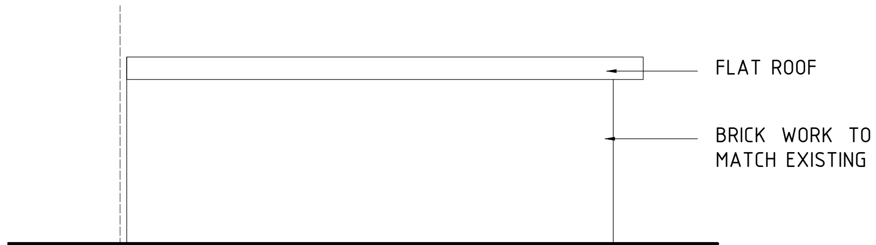
3/ Side Elevation, Scale 1:50