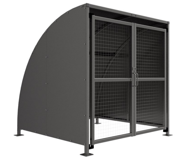
Proposed cycle shelter: Autopa 2x2m SG1 variant of the Stratford shelter.