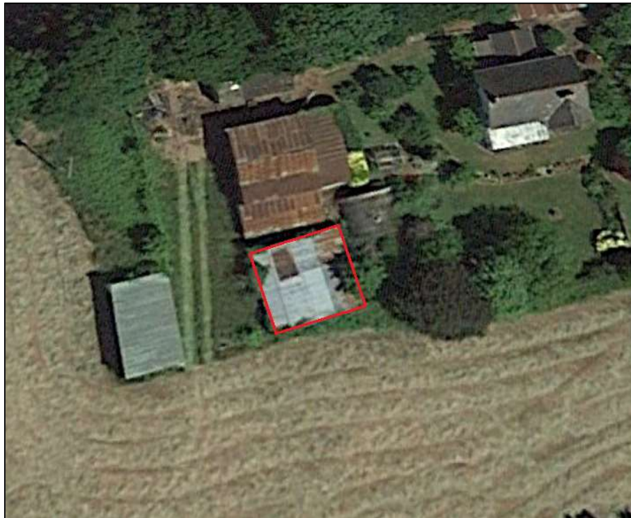
Figure 1. Location of the barn. GoogleEarth June 2022.