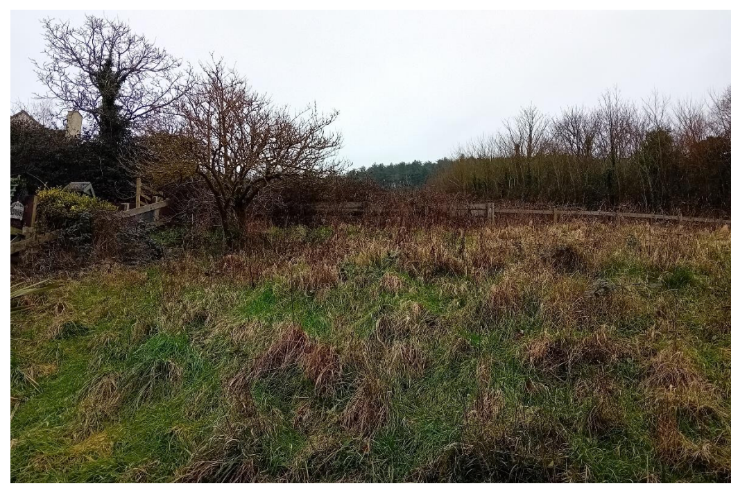
The garden at the rear of the site is set back from the road and screeded from Chapel Street by both the existing dwelling and the planting along the site boundary