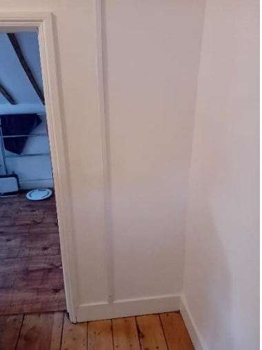
The existing wall between the bathroom and corridor is studwork. This application includes a proposal to reposition part of this wall to enable the enlargement of the existing bathroom. This would improve the usability of the bathroom with minimal impact on the use of the corridor and no detriment to the overall layout or character of the dwelling.