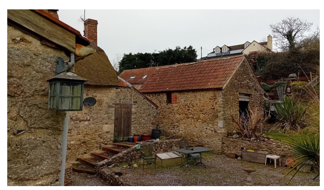
The rear "courtyard" of the property would house the new air source heat pumps. This is well screeded from the road, and detached from the dwelling so as not to impact the historic fabric.