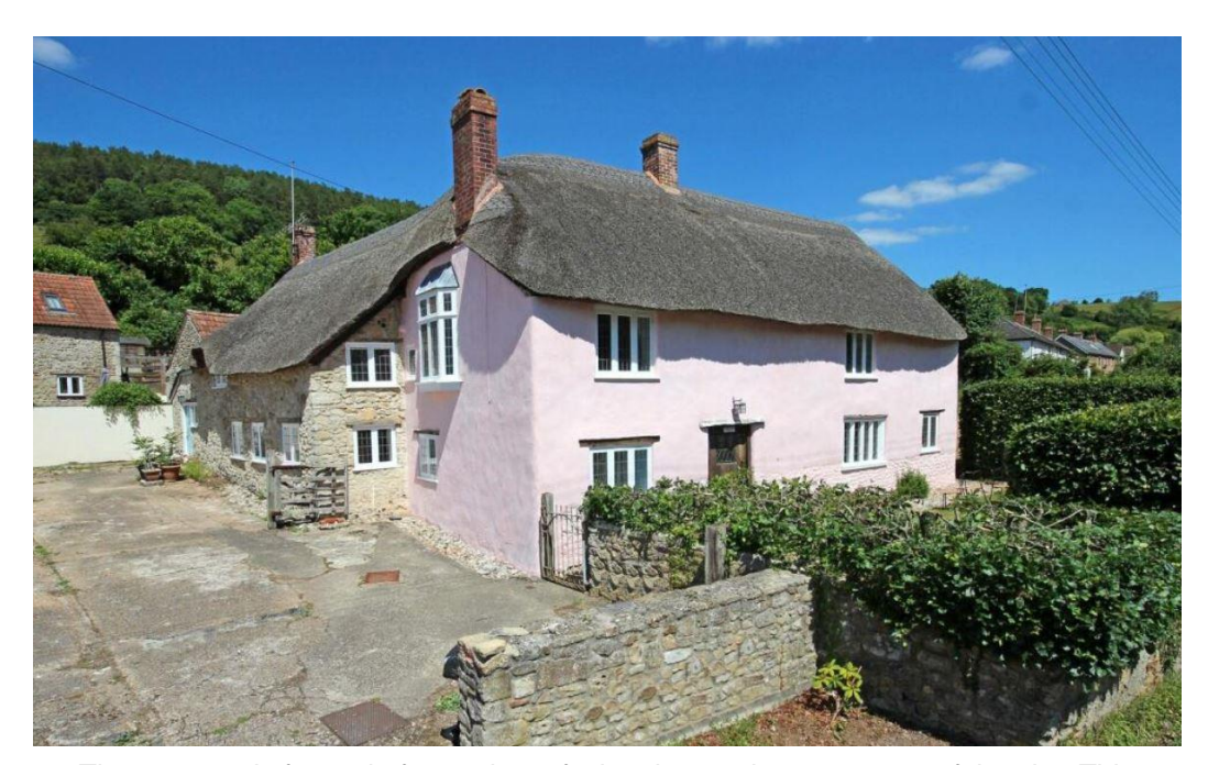
The property is formed of two wings, facing the south west corner of the site. This screens the amenity space at the rear of the site from the public realm.

2.03 Existing Building: Southcombe Farmhouse is an "L" shaped dwelling within the South West of the site, facing towards Chapel Street.