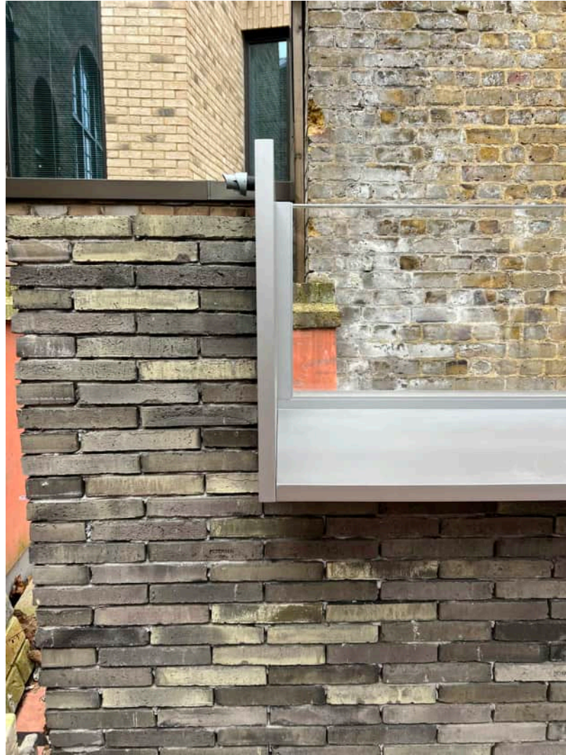
Sample Panel as constructed onsite