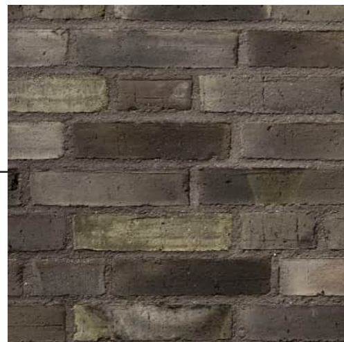
Petersen Tegl D54 Waterstruck blue- tempered clay brick with Anthracite mortar