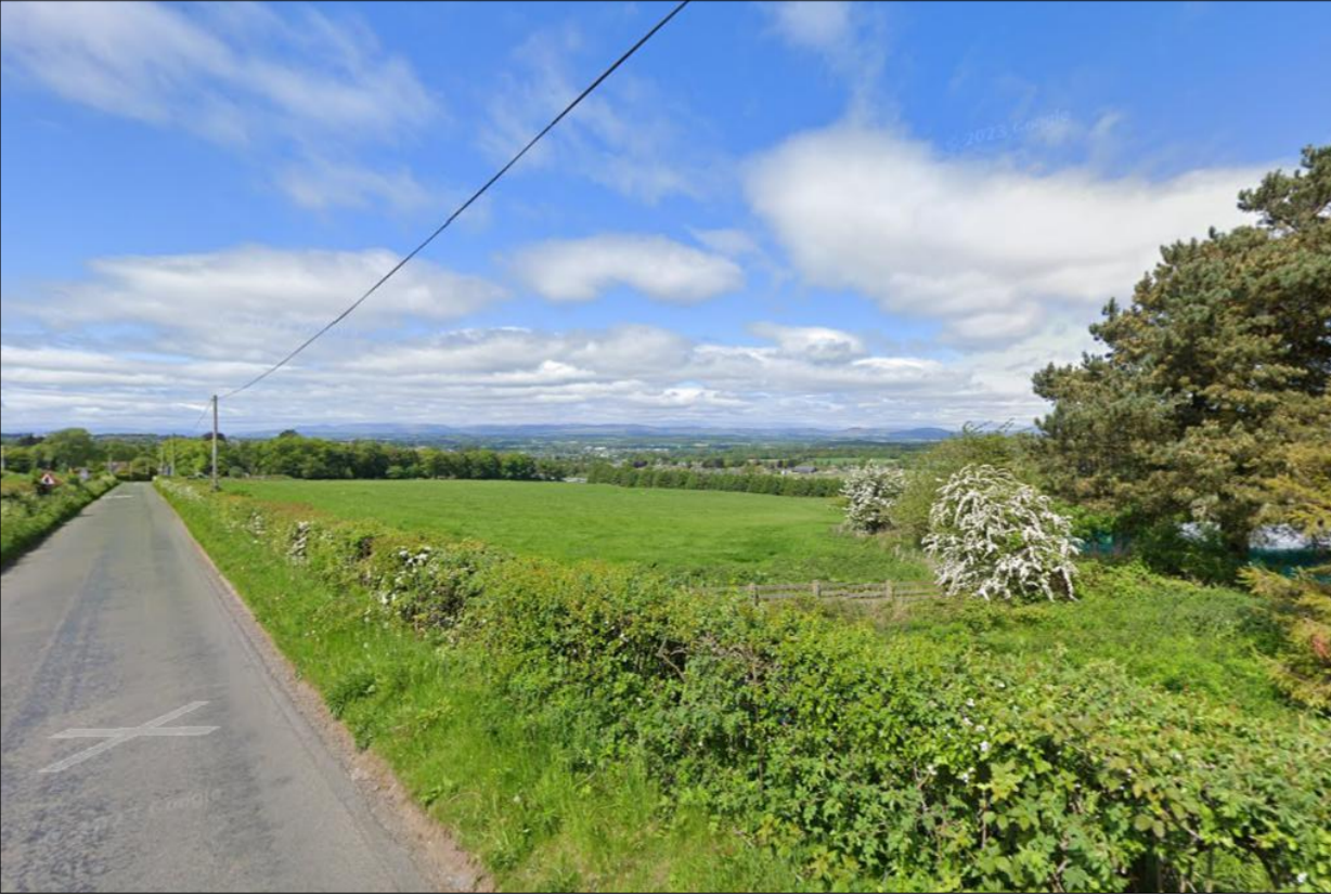
5. VIEW LOOKING WEST ALONG PROPOSED PATH ROUTE ADJACENT TO MUIRHALL ROAD CLOSE TO ACCESS POINT ONTO PATH (FROM GOOGLE STREET VIEW)