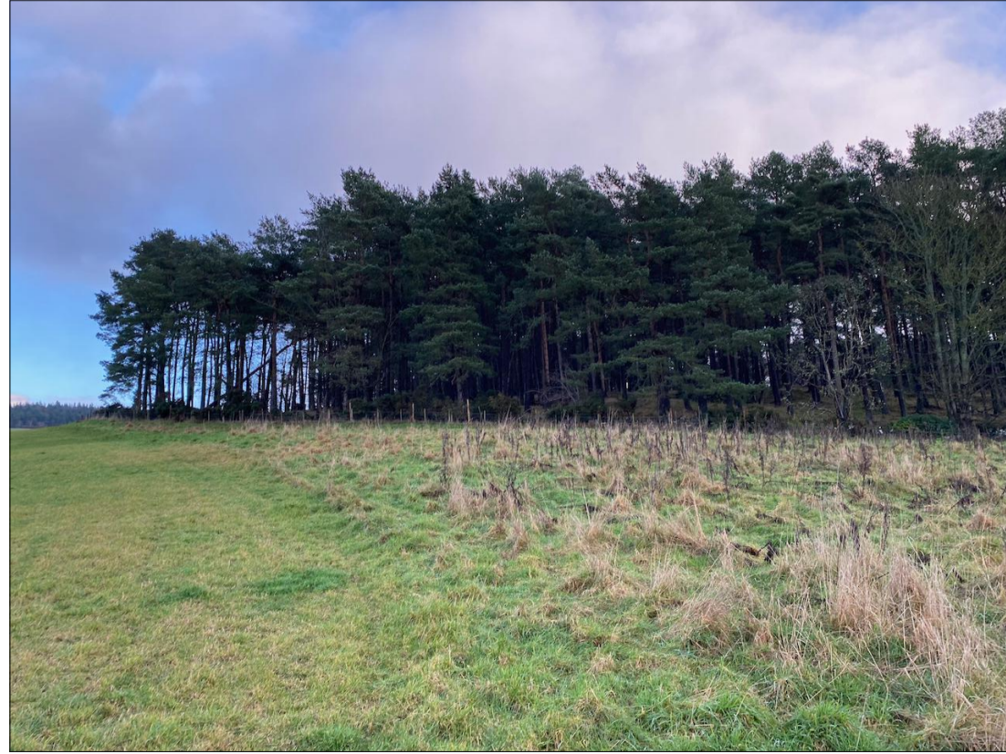
8. VIEW LOOKING EAST ALONG PROPOSED PATH ROUTE AND NEW WOODLAND AREA