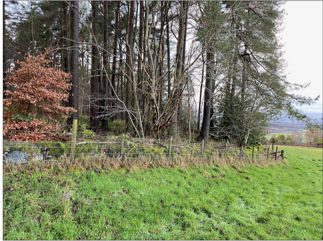
9. VIEW LOOKING NORTH WEST SHOWING EXISTING FIELD BOUNDARY