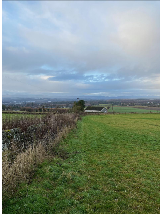
7. VIEW LOOKING NORTH ALONG PROPOSED PATH AND WILDLIFE CORRIDOR ROUTE