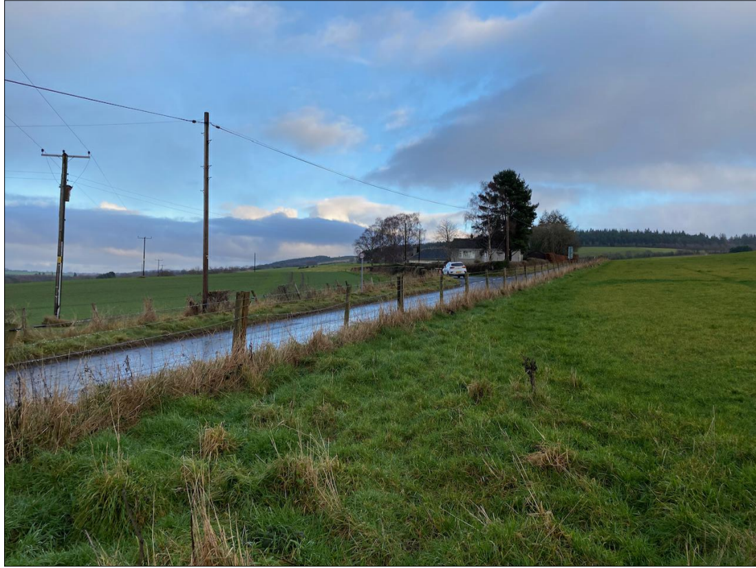
6. VIEW LOOKING NORTH EAST ADJACENT TO MUIRHALL ROAD CLOSE TO ACCESS POINTS ONTO PATH