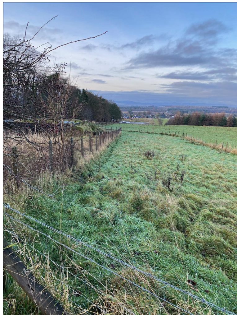
2. VIEW LOOKING NORTH ALONG SITE OF PROPOSED FOOTPATH ADJACENT TO EXISTING RESERVOIR