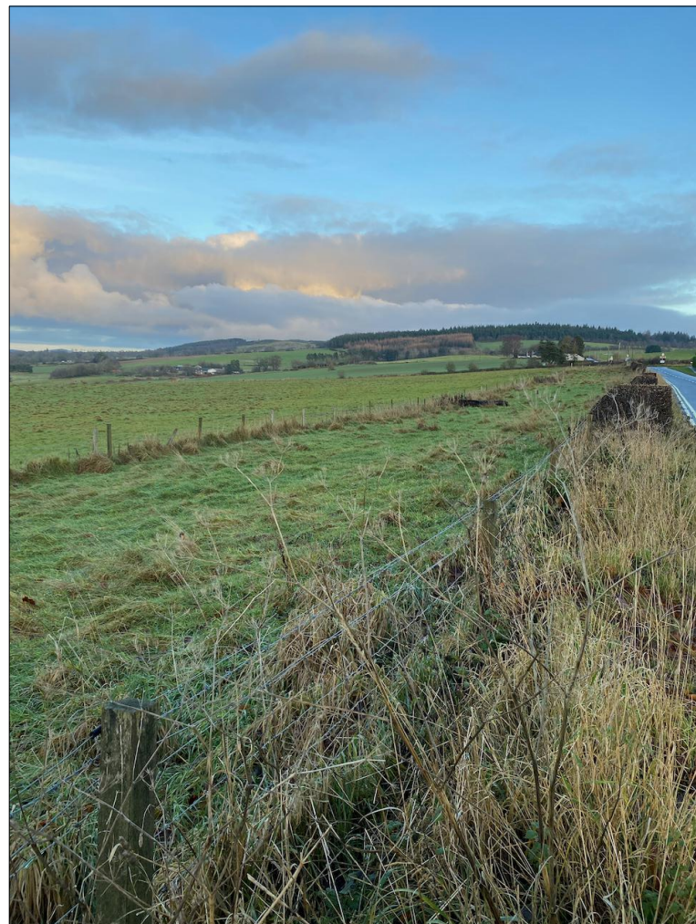
3. VIEW LOOKING EAST ALONG PROPOSED PATH ROUTE ADJACENT TO MUIRHALL ROAD