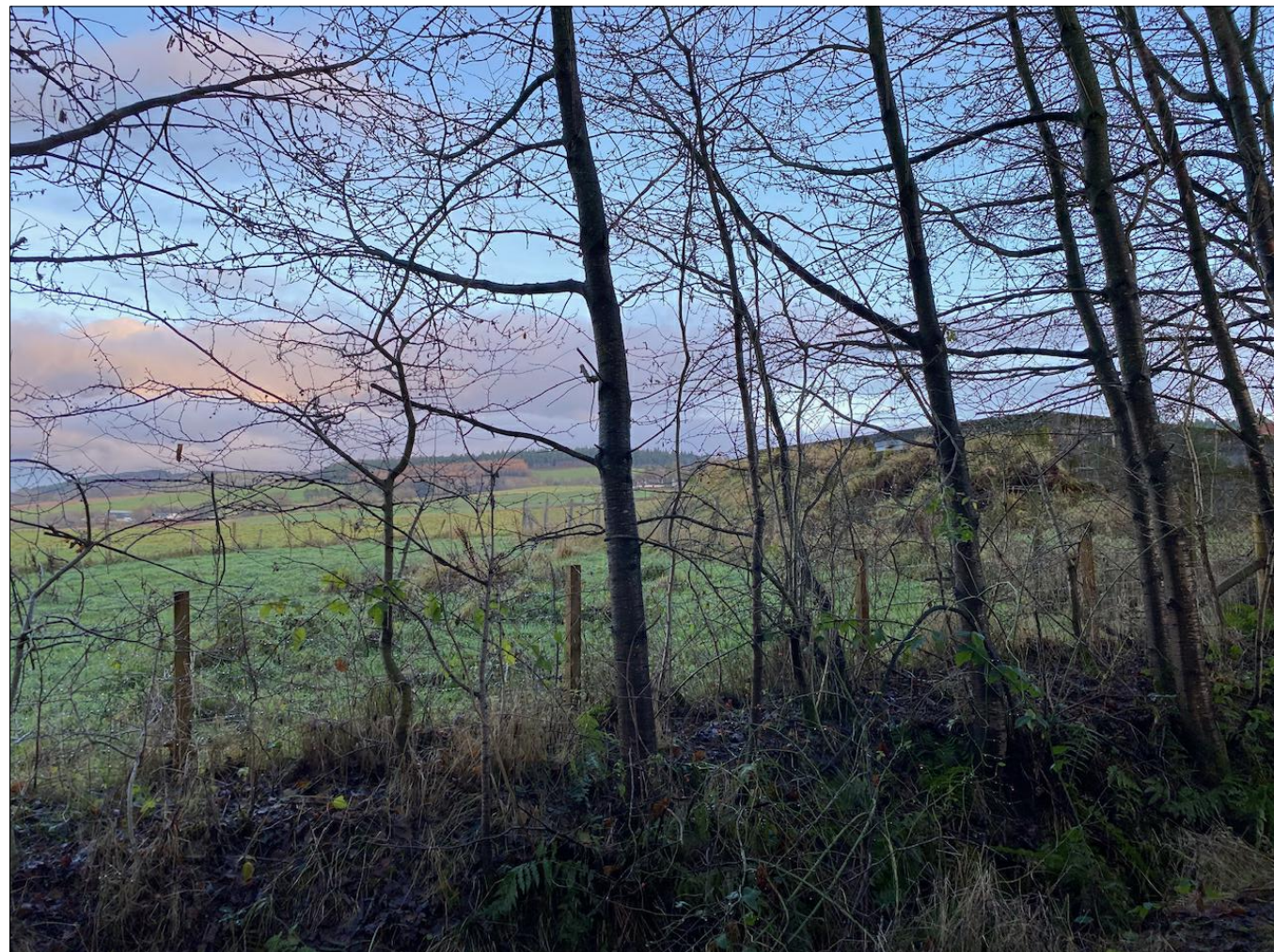
1. VIEW LOOKING EAST CLOSE TO ENTRY ONTO PATHWAY AND PROPOSED CULVERT