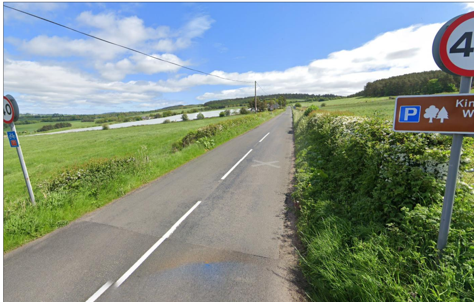
4. VIEW LOOKING EAST ALONG PROPOSED PATH ROUTE ADJACENT TO MUIRHALL ROAD FROM JUNCTION OF CORSIE HILL ROAD (FROM GOOGLE STREET VIEW)