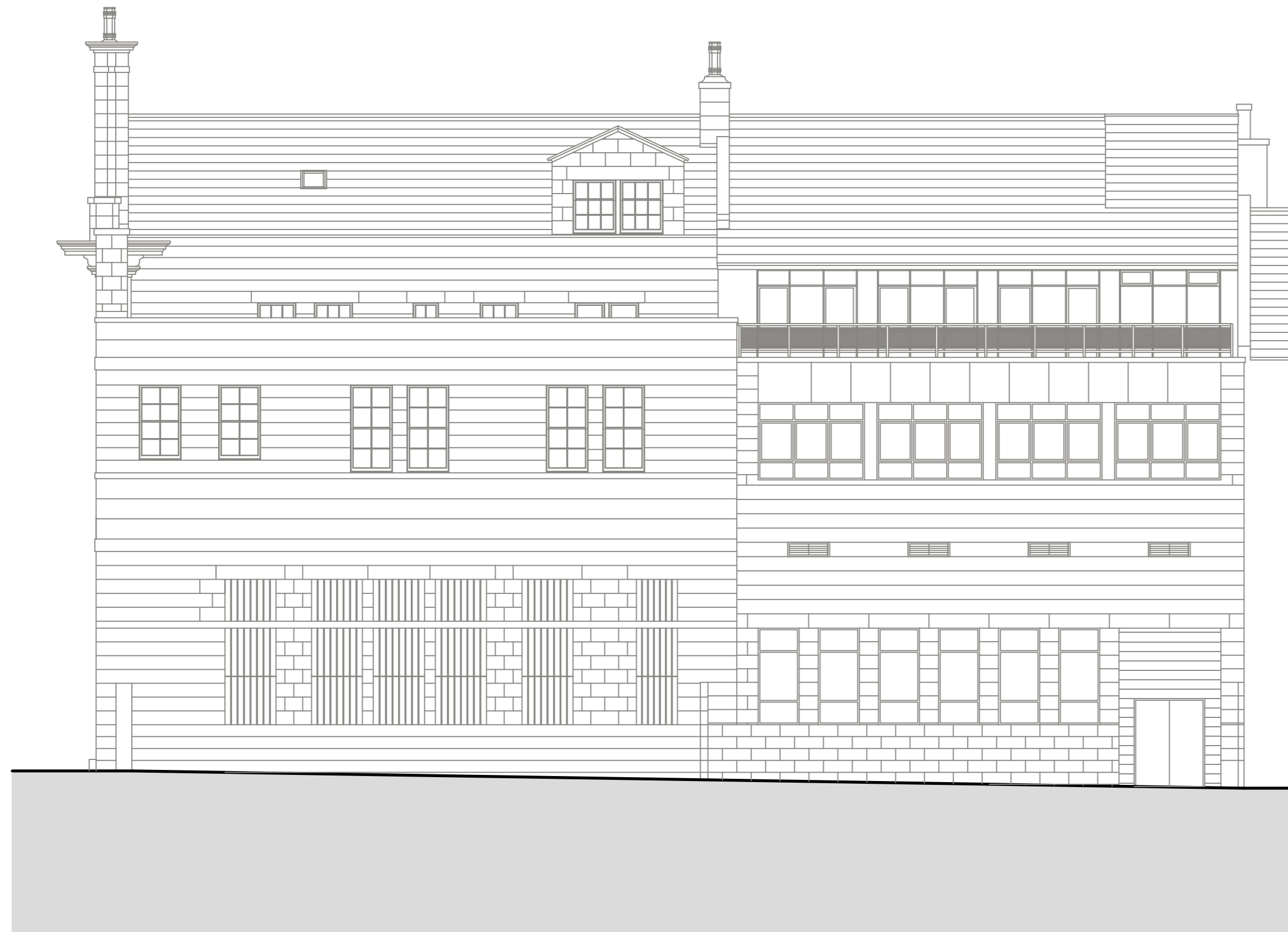
EXISTING WEST ELEVATION DIAMOND STREET