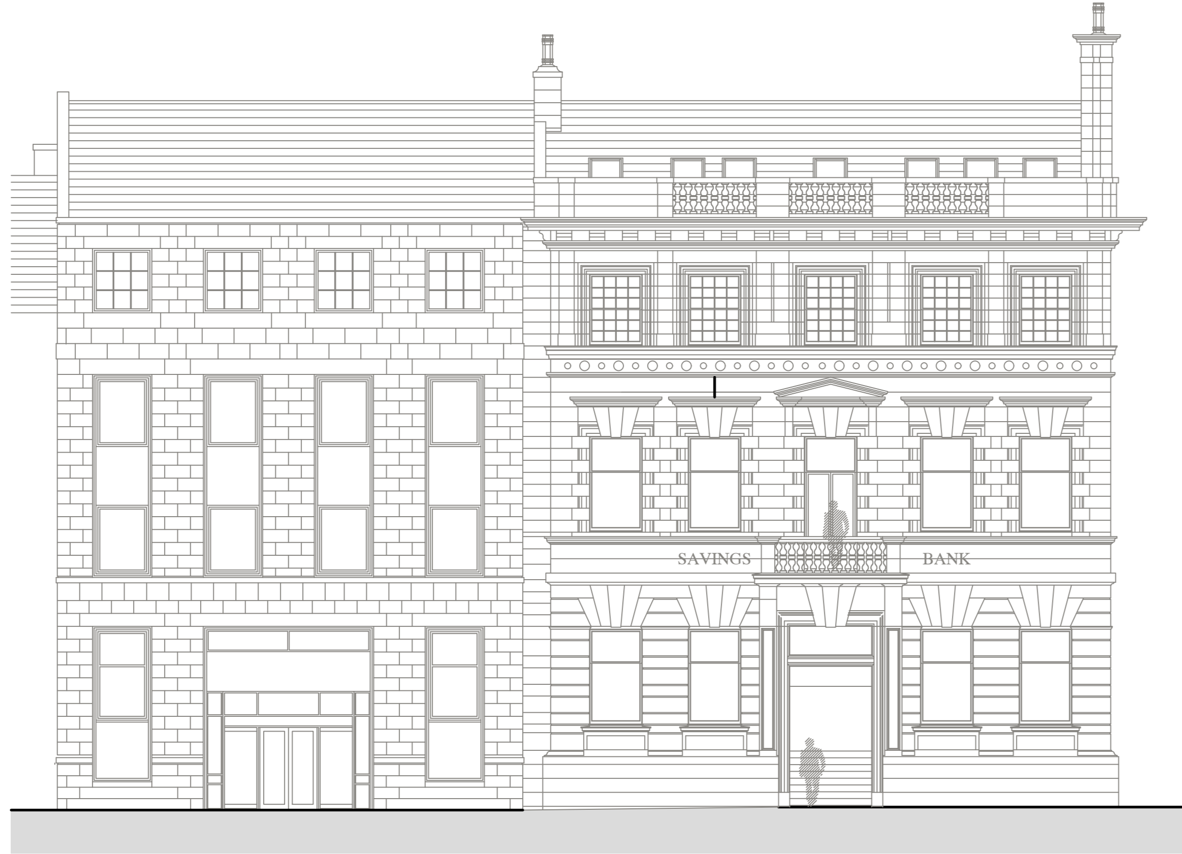
EXISTING EAST ELEVATION UNION TERRACE