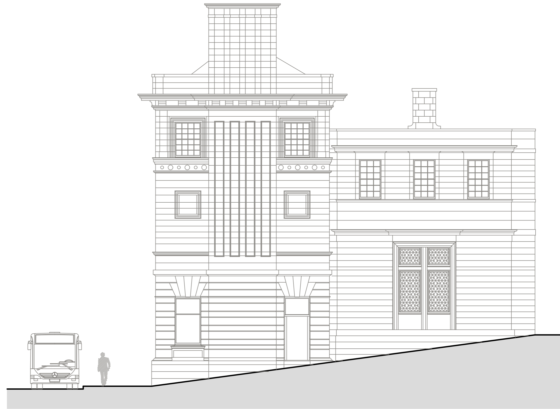
EXISTING NORTH ELEVATION DIAMOND PLACE