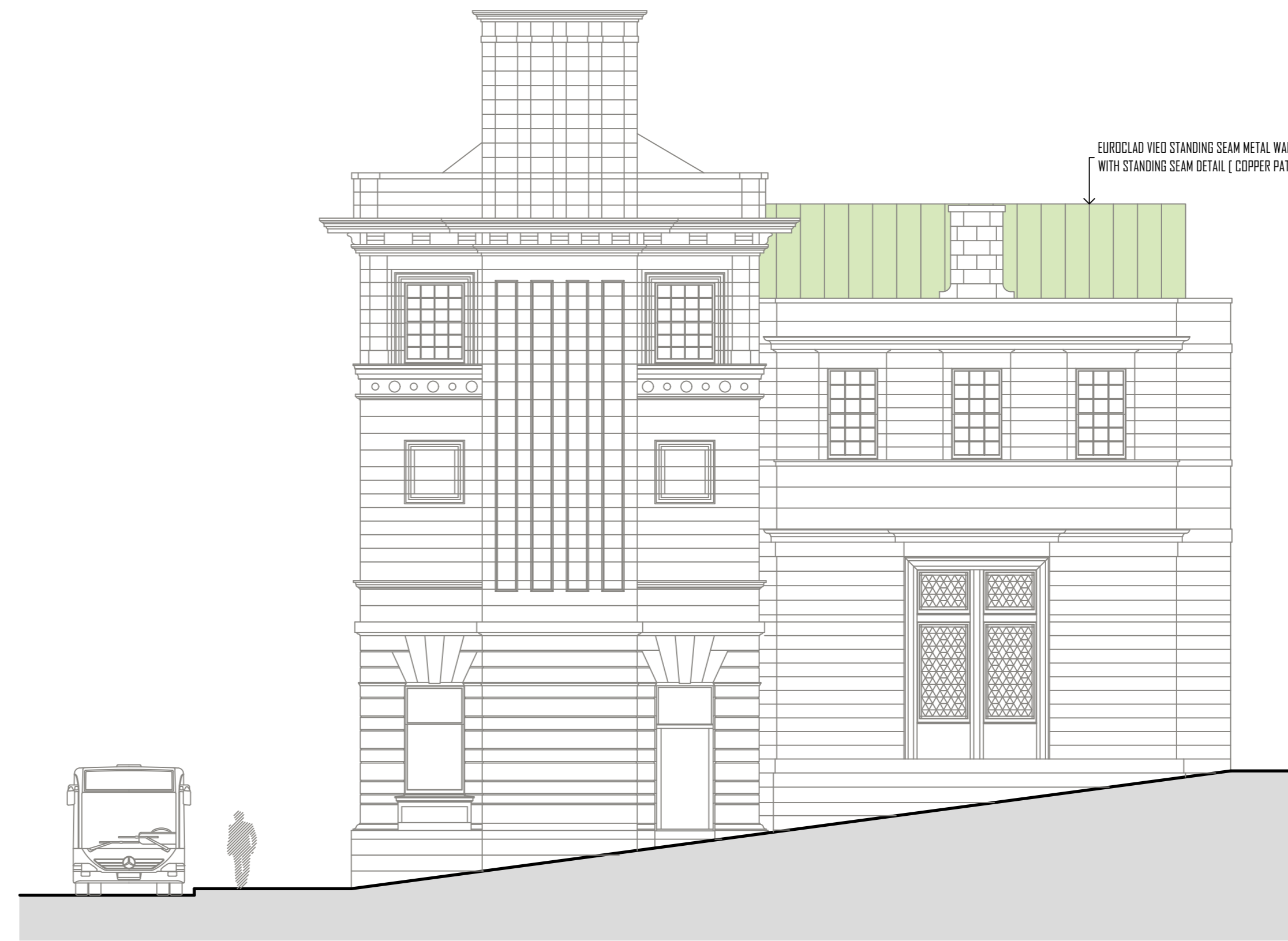
PROPOSED NORTH ELEVATION DIAMOND PLACE