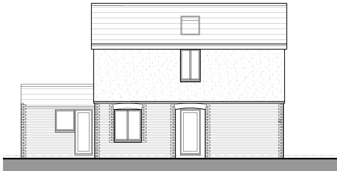
Side Elevation Scale 1:100