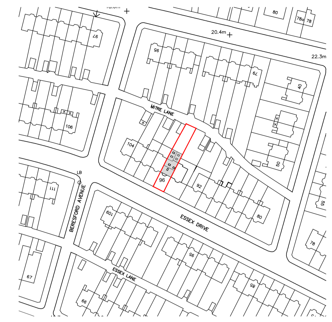
LOCATION PLAN @ 1.1250