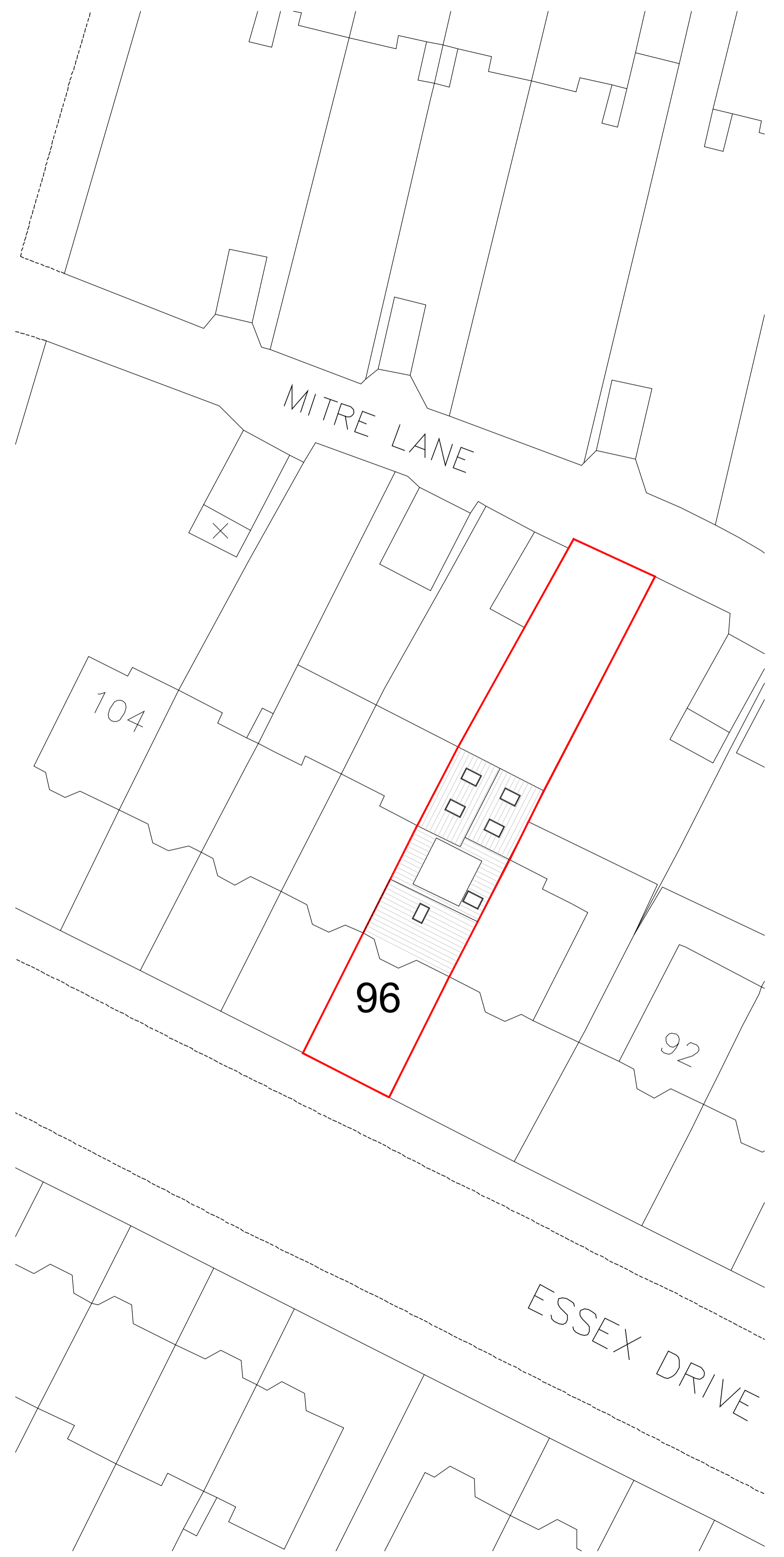
PROPOSED BLOCK PLAN @ 1.200