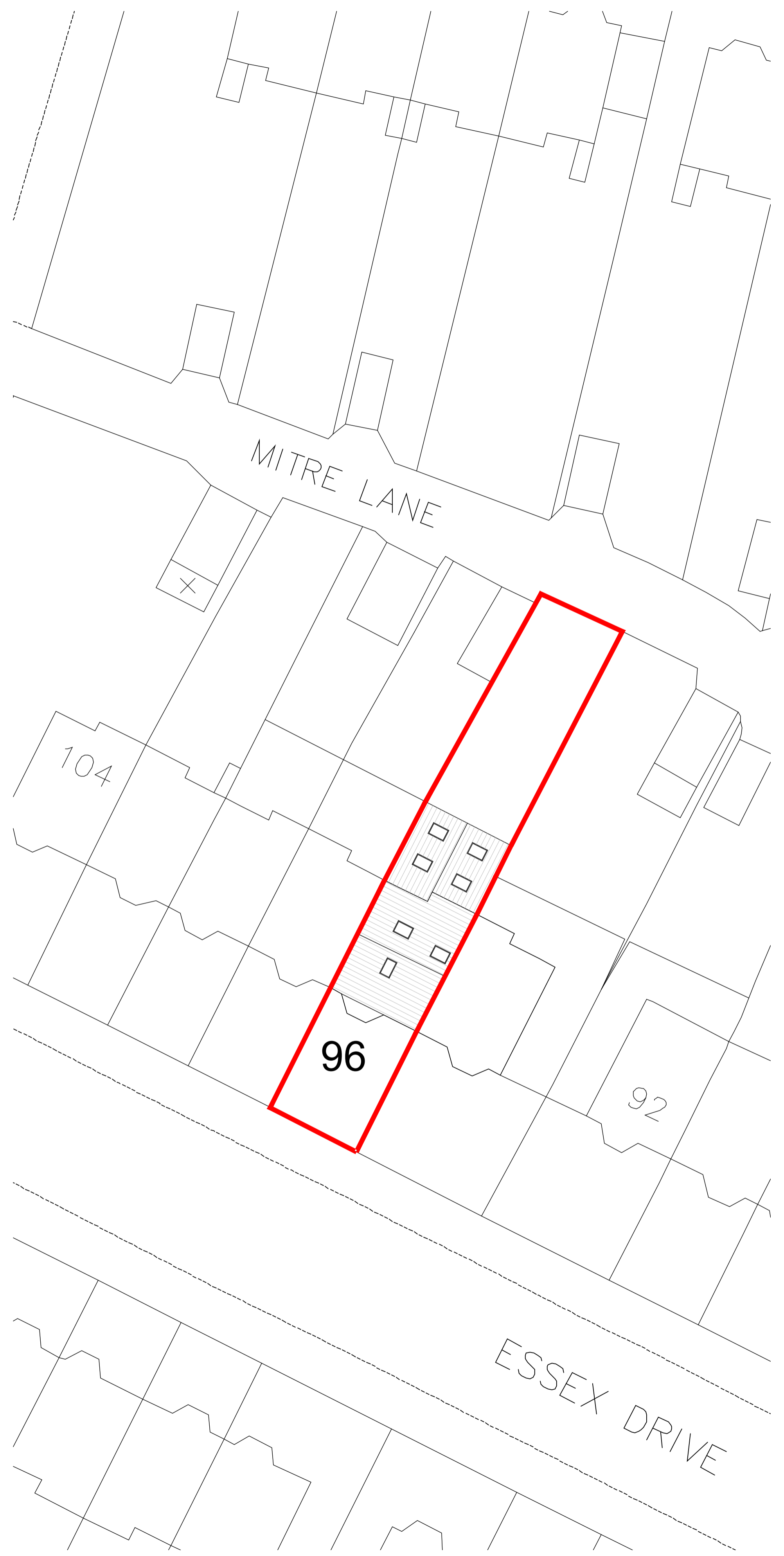
EXISTING BLOCK PLAN @ 1.200