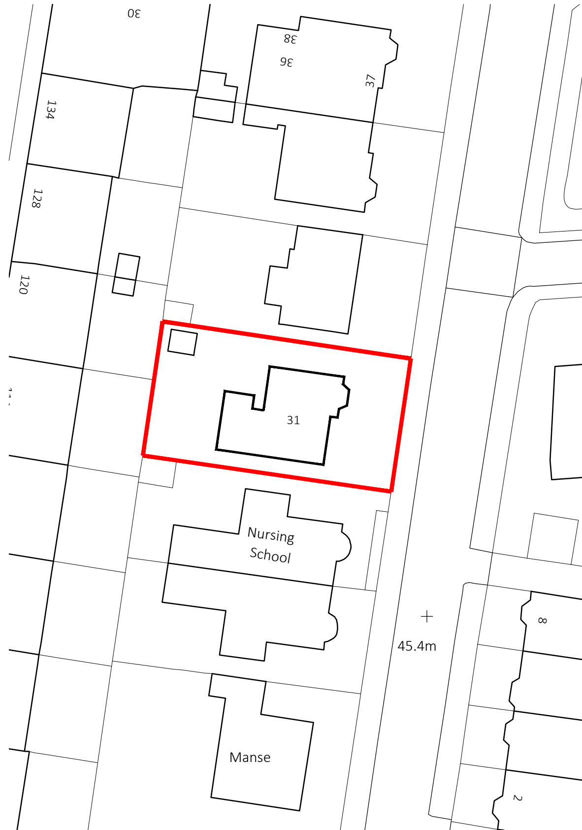
BLOCK PLAN AS EXISTING