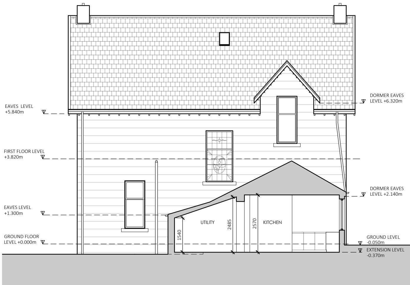
SECTION A-A AS EXISTING