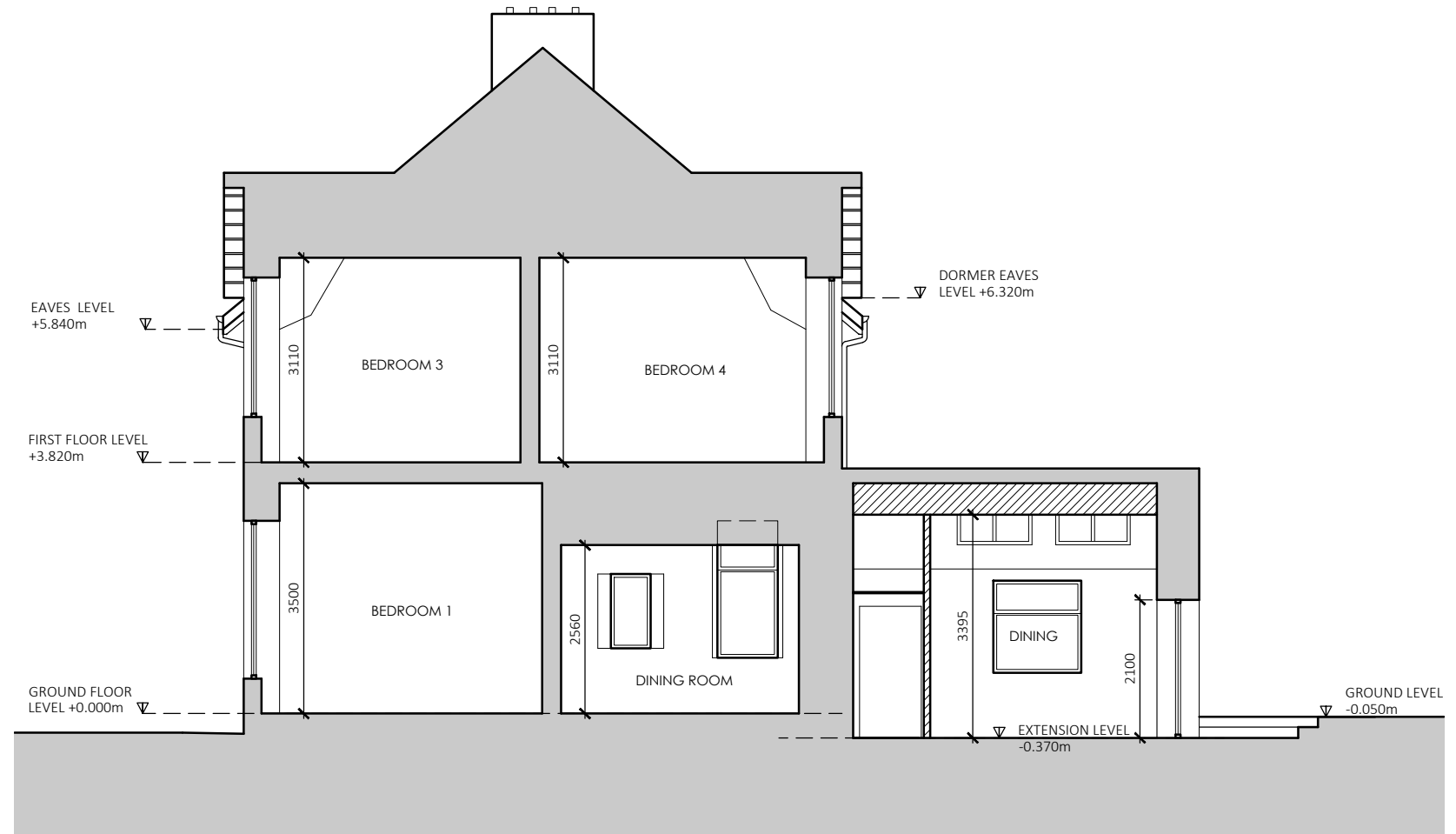
SECTION B-B AS PROPOSED