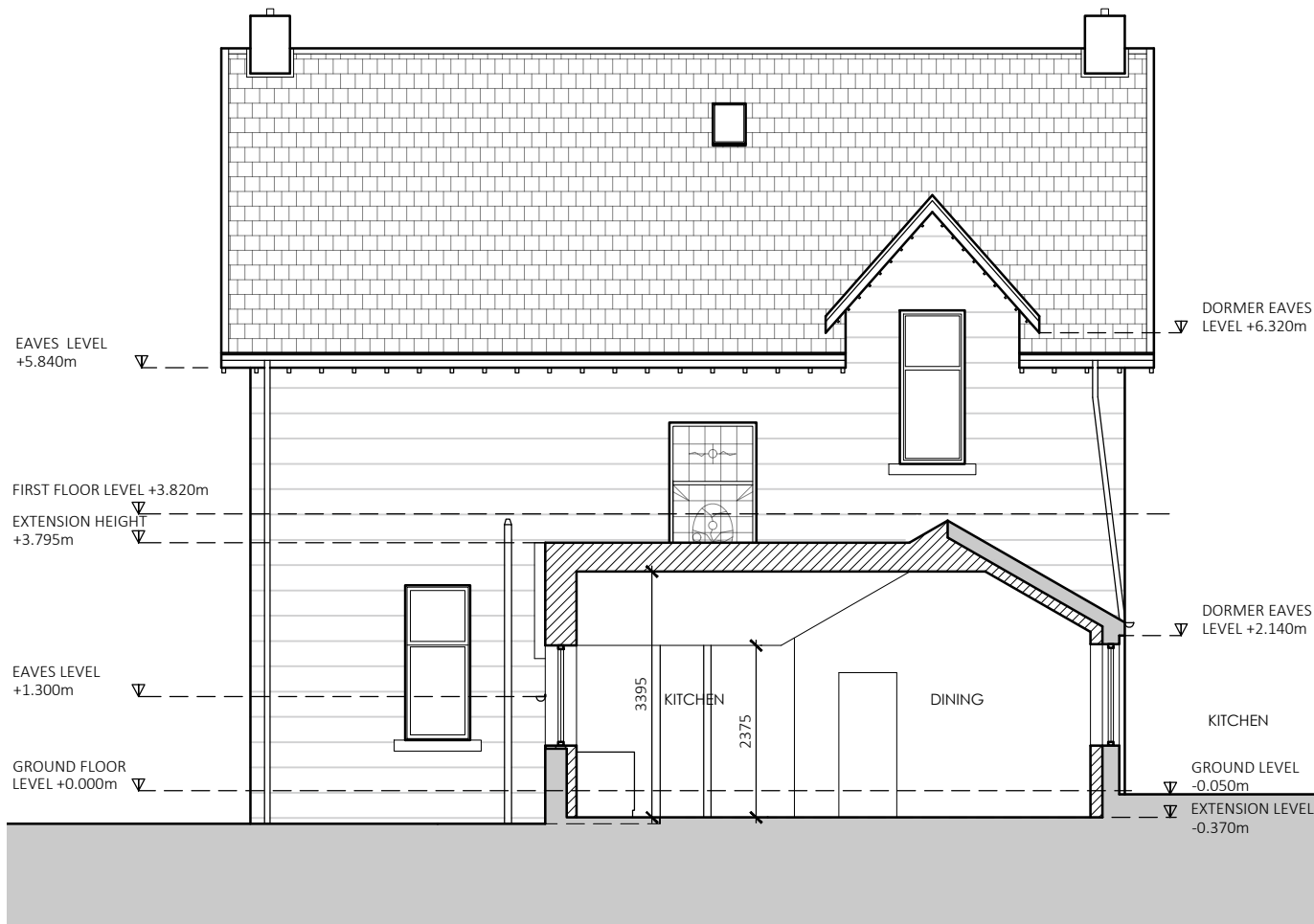
SECTION A-A AS PROPOSED