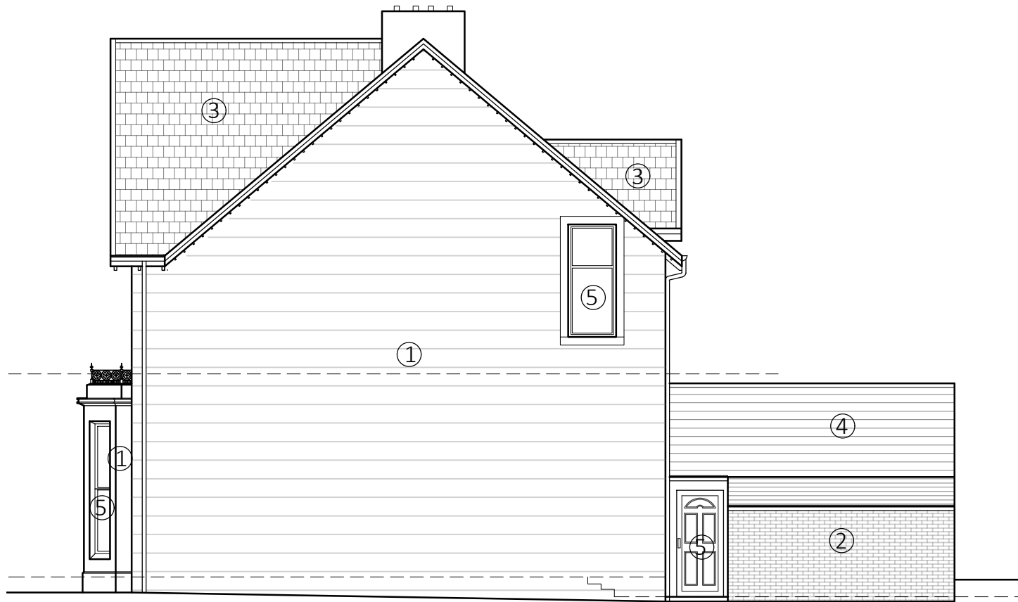
NORTH ELEVATION AS EXISTING