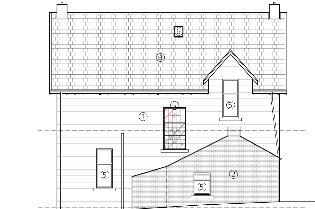
WEST ELEVATION AS EXISTING