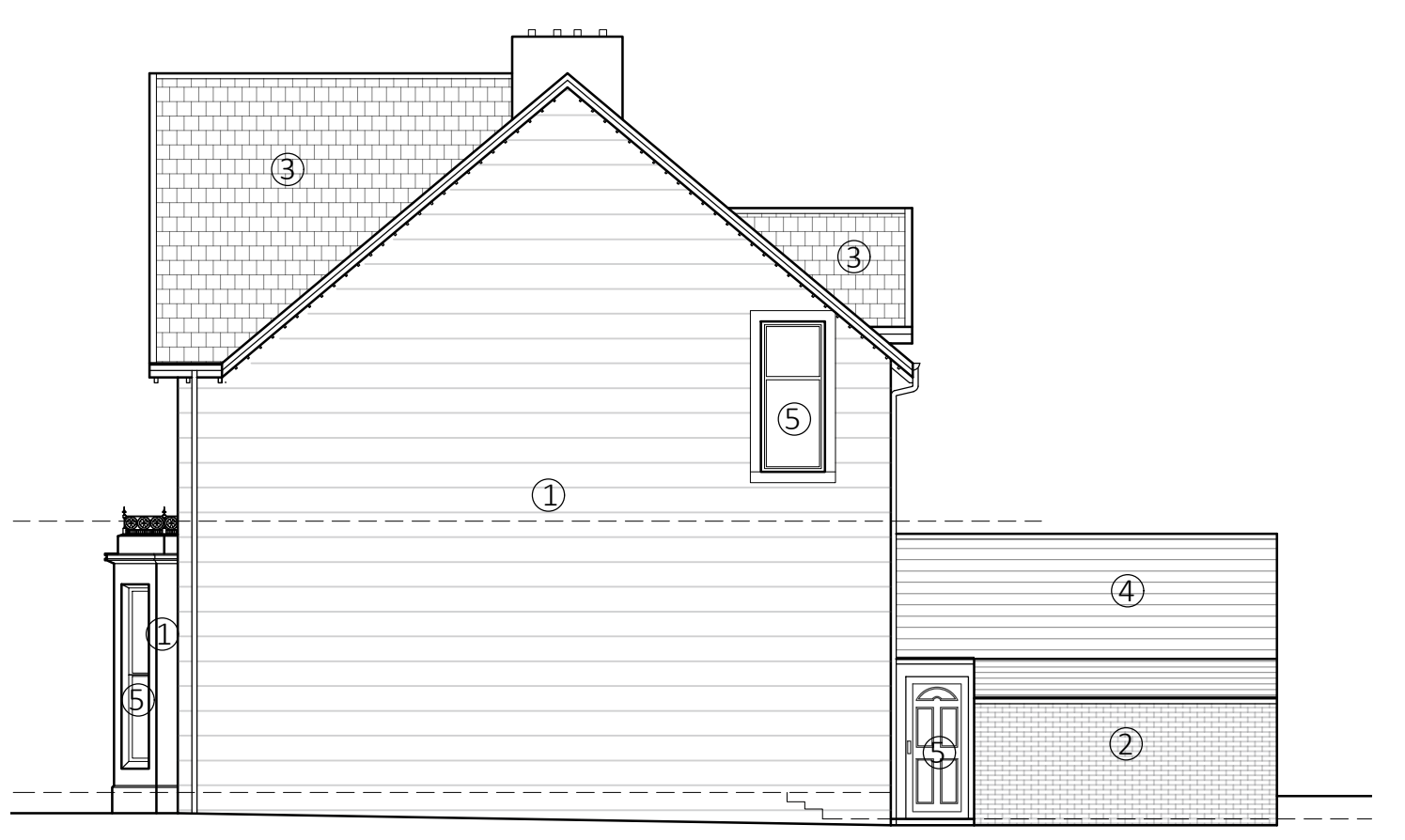
NORTH ELEVATION AS EXISTING