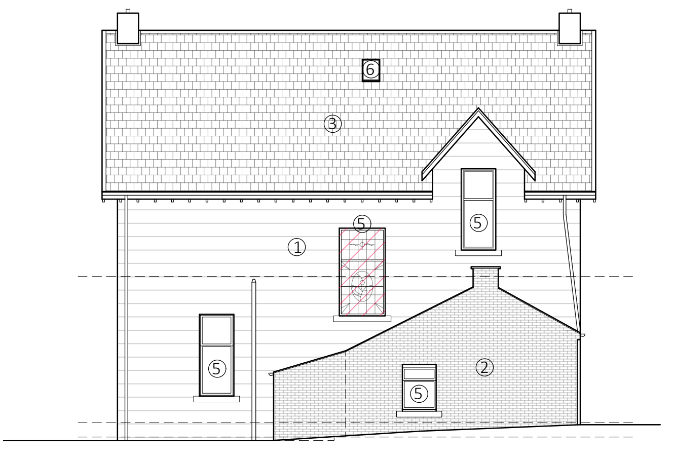
WEST ELEVATION AS EXISTING