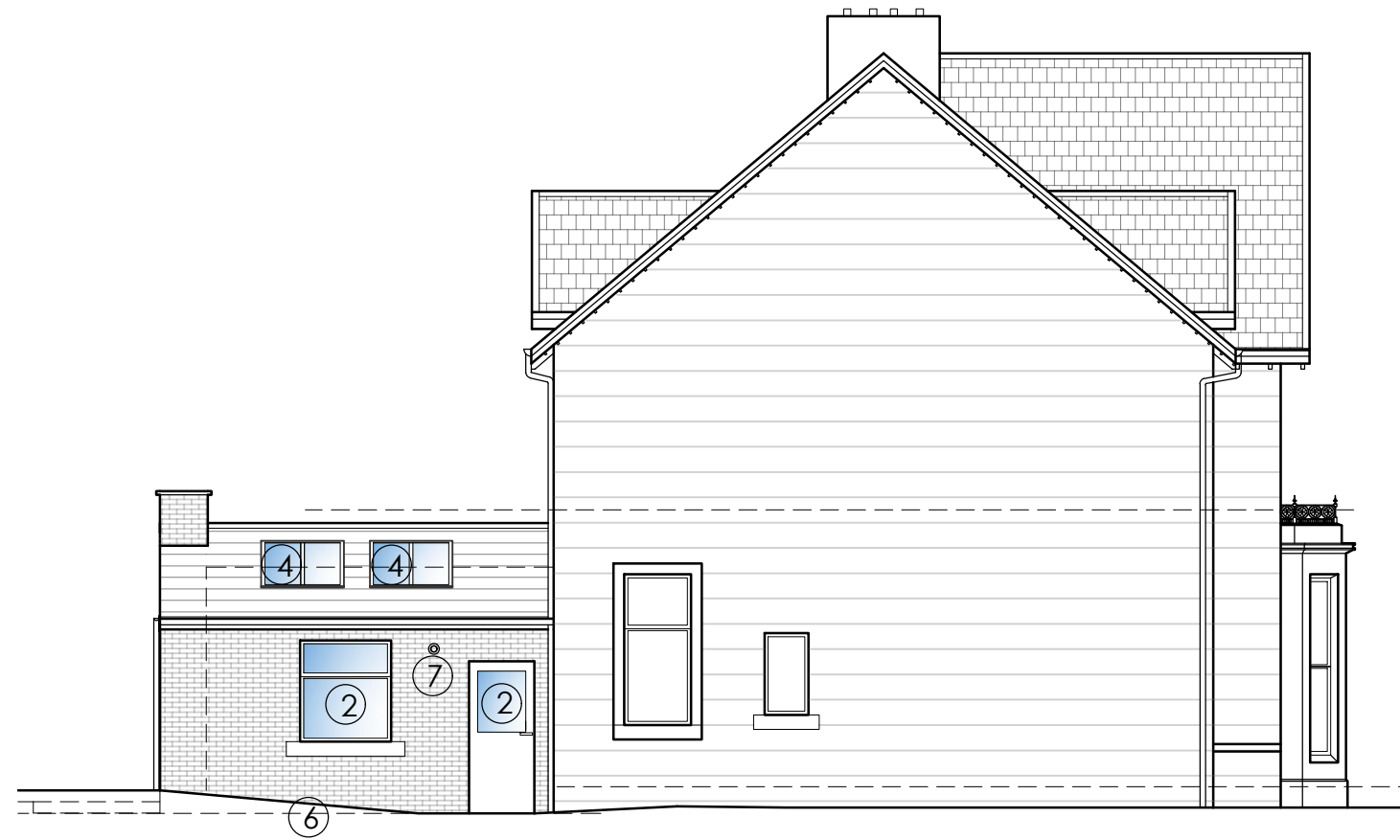
SOUTH ELEVATION AS PROPOSED