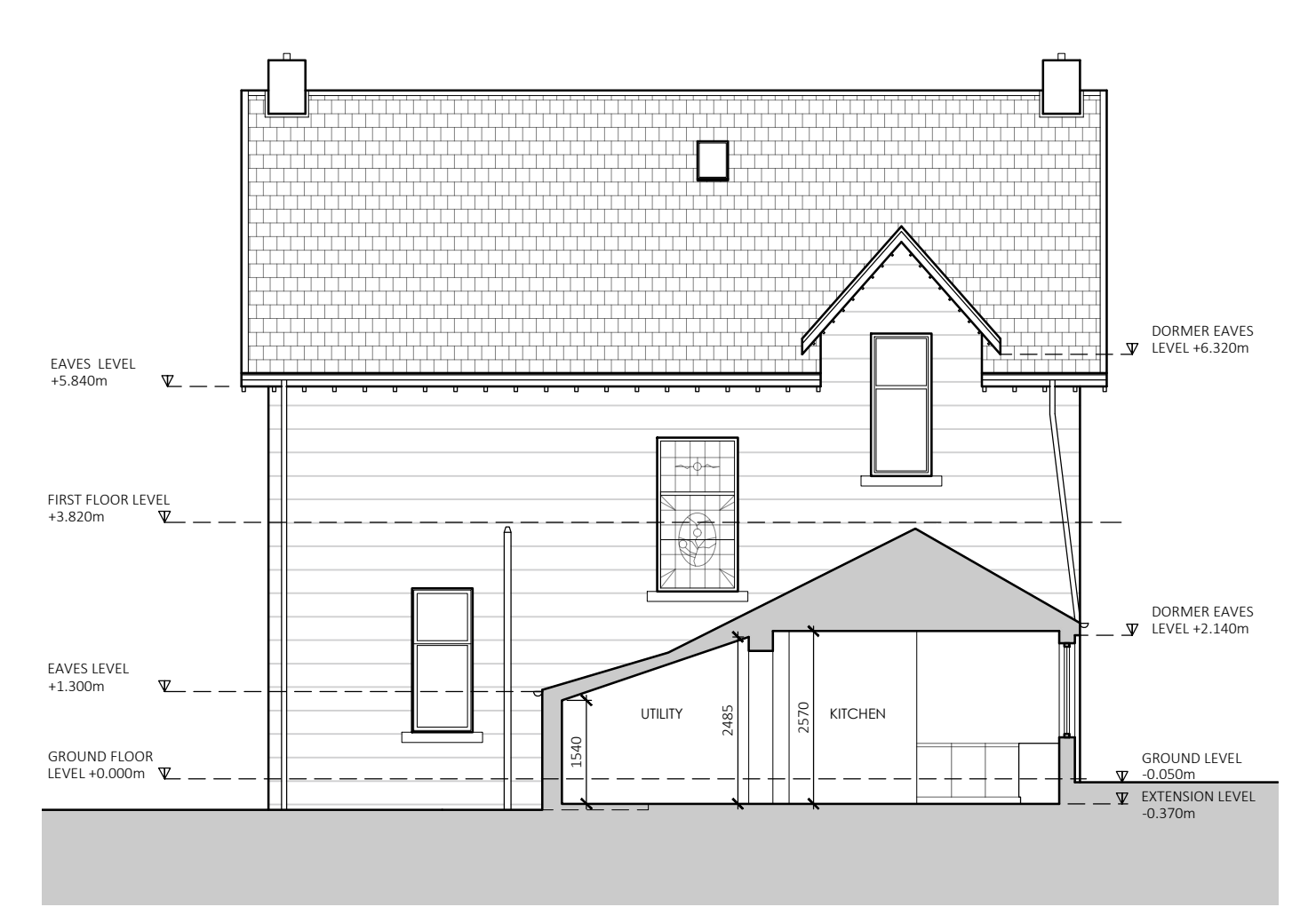
SECTION A-A AS EXISTING