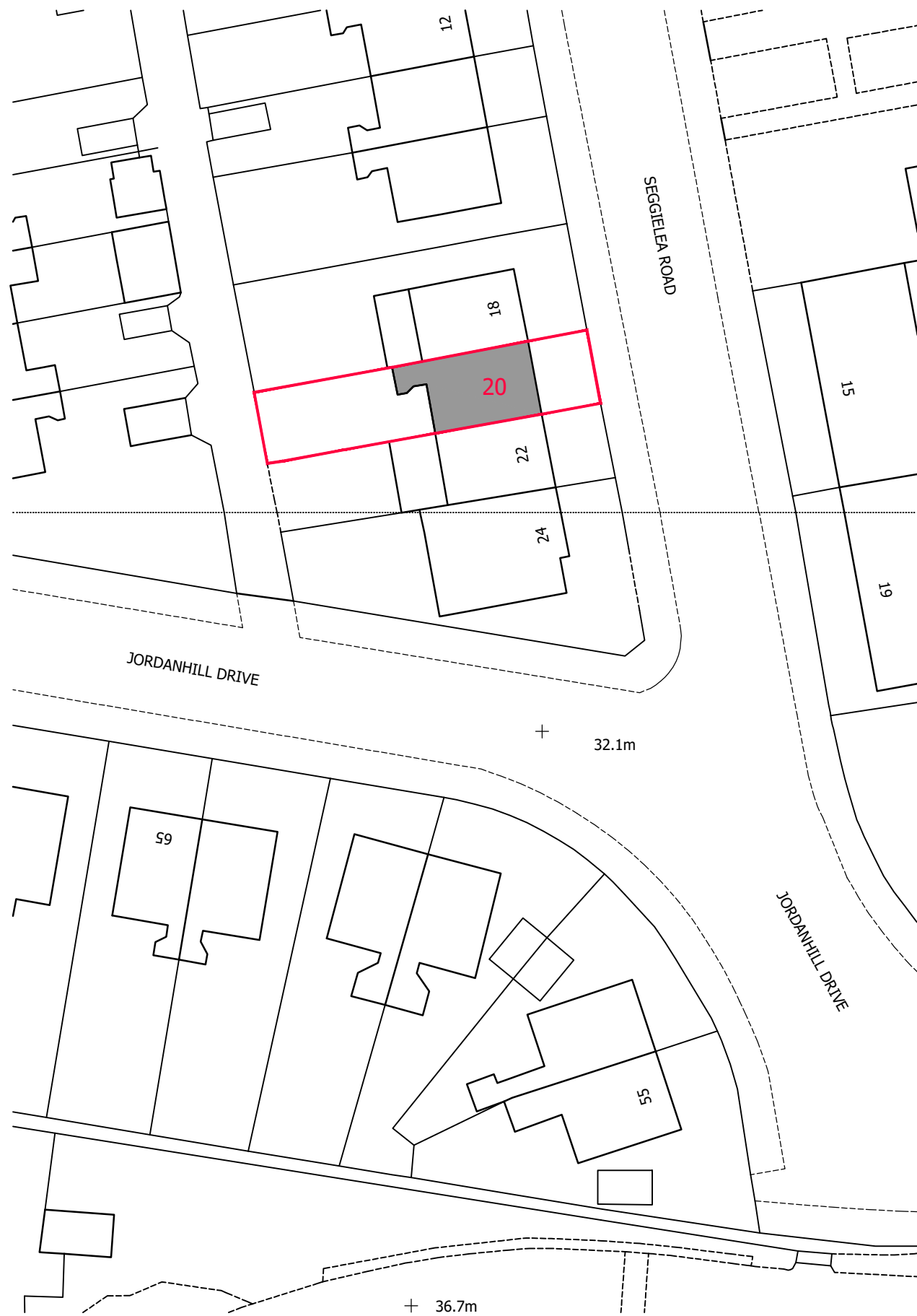
BLOCK PLAN AS EXISTING

If in doubt, ask. This drawing is the property of the applicant and must not be copied, reproduced or disclosed other than for the purposes of this project.