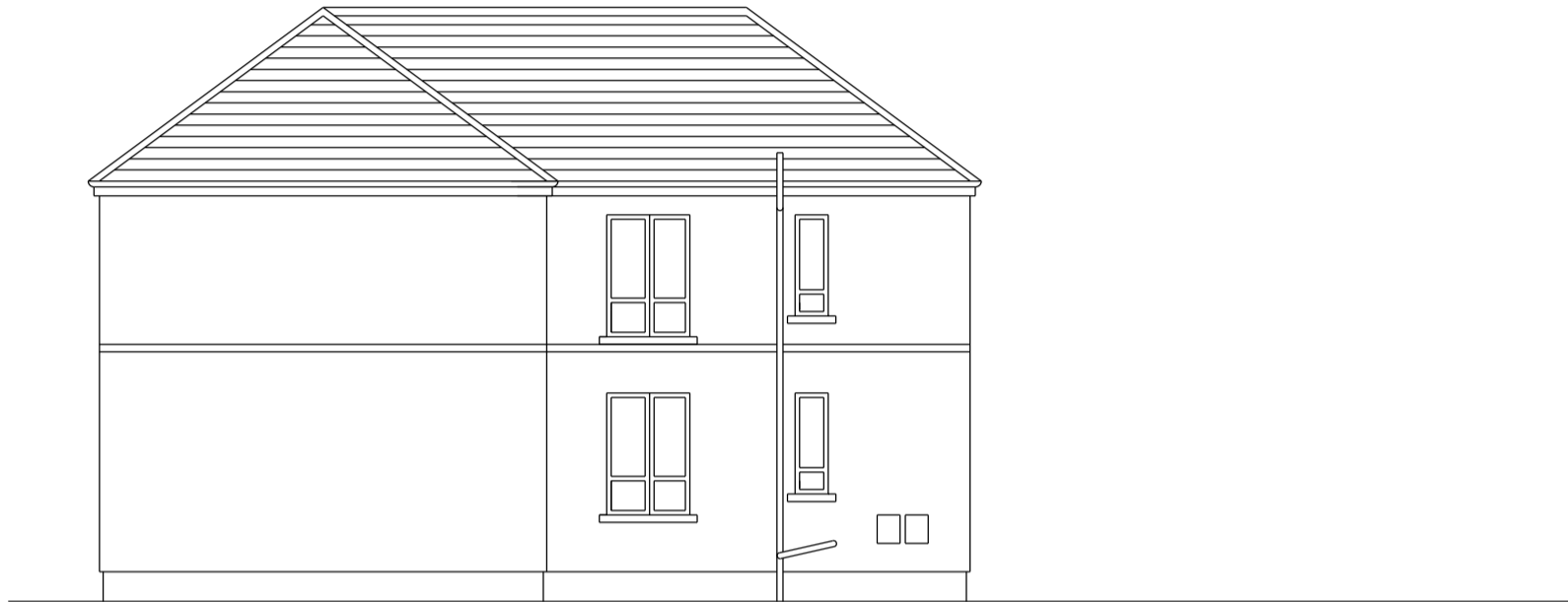
B Existing Side Elevation (Fences omitted from Side Elevation for clarity)