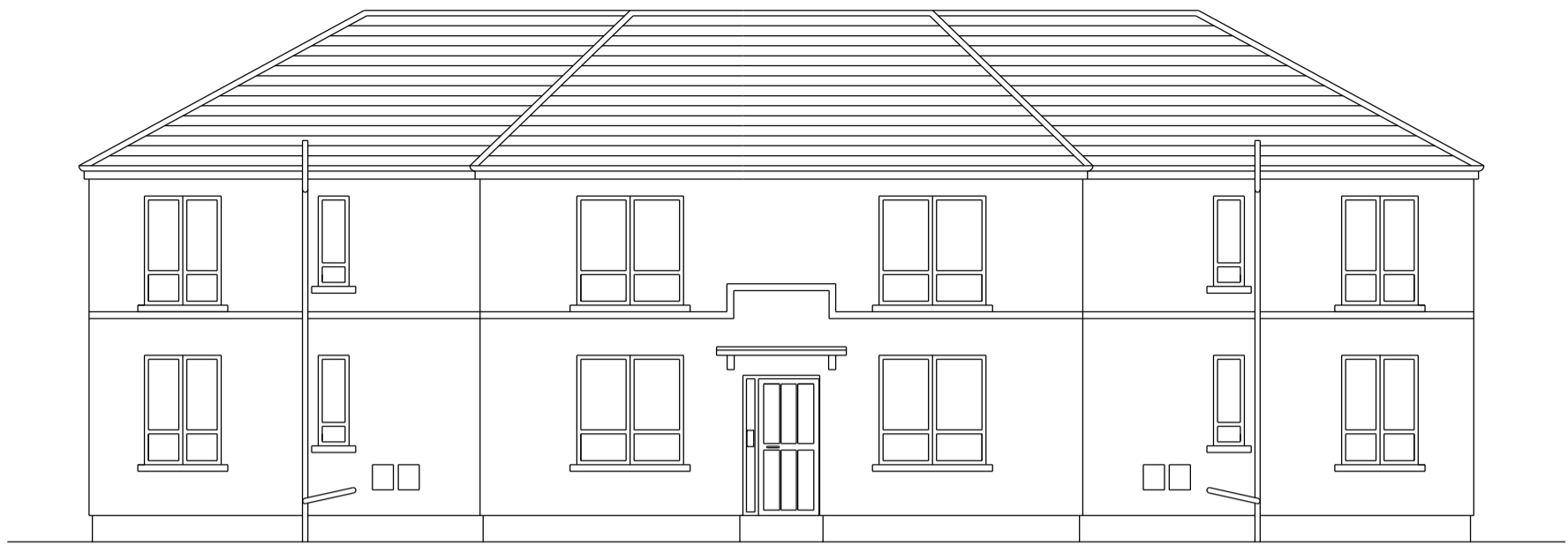
A Existing Front Elevation (Fences omitted from Front Elevation for clarity)