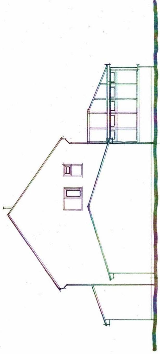
Side East Elevation