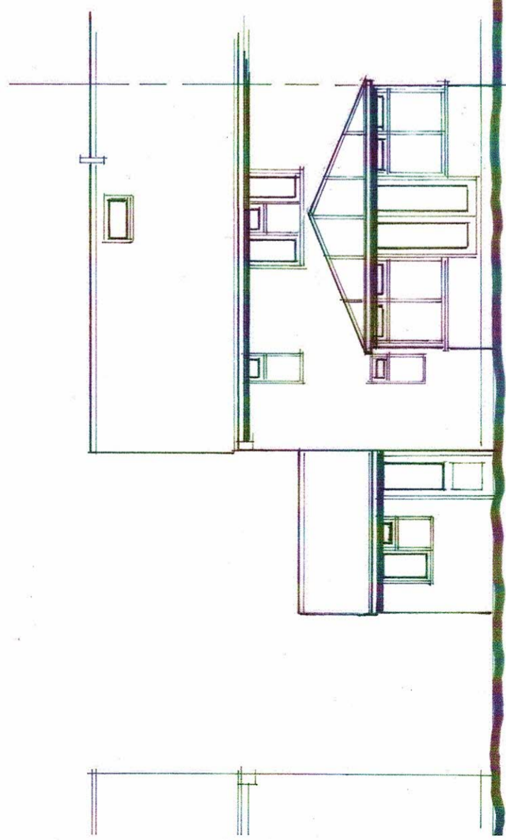
Rear North Elevation