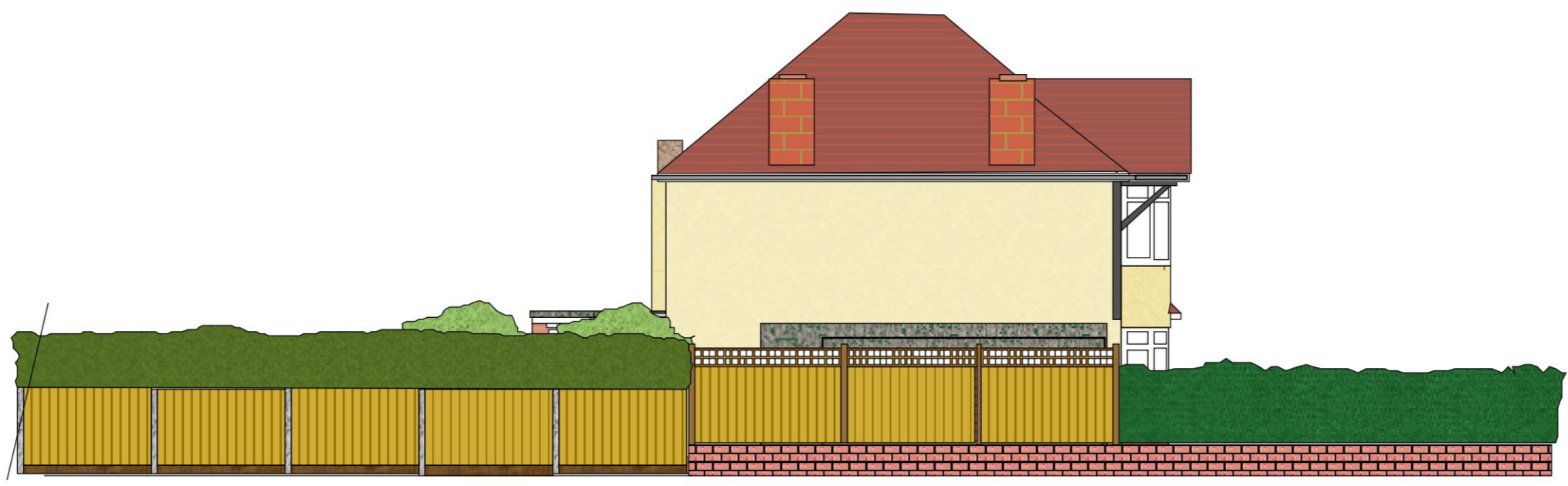
SIDE ELEVATION from Devon Way